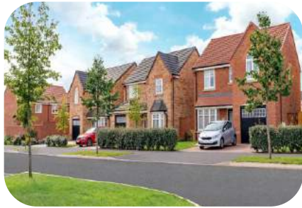
Finding new homes and safety