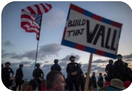
Reluctance to welcome refugees by host countries