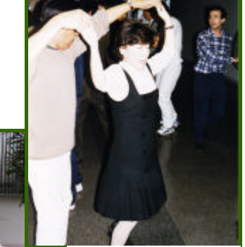
I won't tell you who it