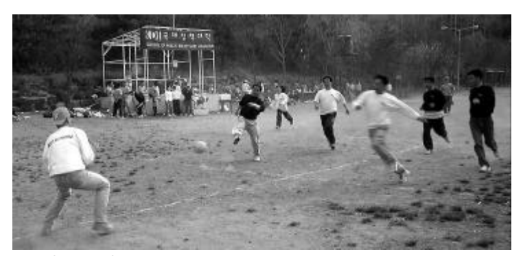
He shoots... he scores!