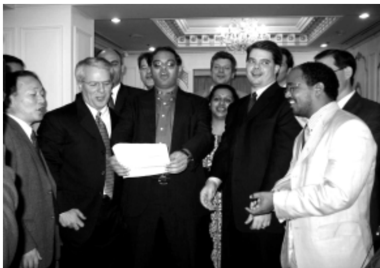
IMPM participants sing "The IMPM Song" with glee