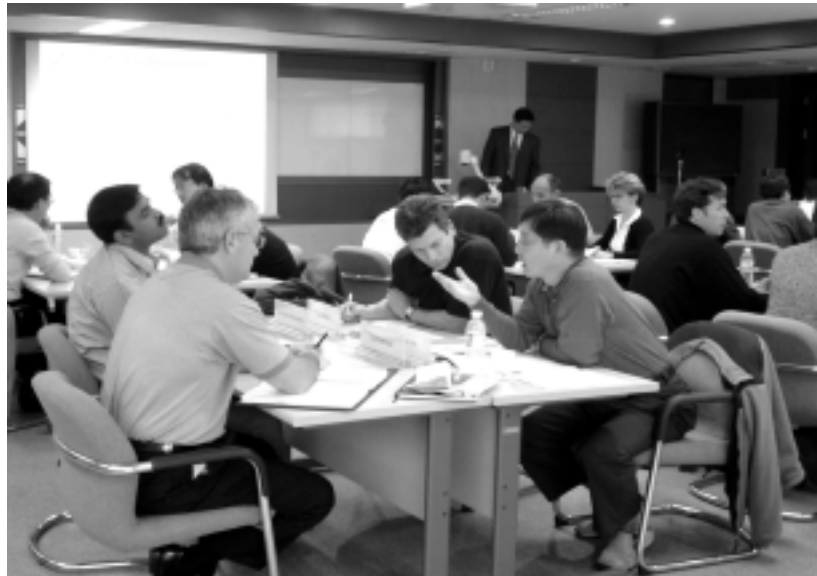
Interaction among students and faculty is a key component of IMPM

To overcome these limits of the traditional MBA, Mintzberg and Gosling joined with like-minded