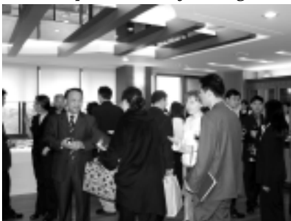
Reception in Chunji Lounge