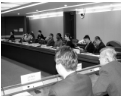
Workshop on Policy Negotiation

O n December 8-12, 2003, the Global Cooperation Division of the KDI School welcomed eighteen international alumni for its week-long Workshop on Policy Negotiation, which was specifically designed to provide alumni from the classes of 1998-2001 with a solid understanding of many of the key policy negotiation issues associated with the new global economic system. The program was also designed to strengthen the global alumni network and demonstrate the School's commitment to providing its alumni with continued learning opportunities.