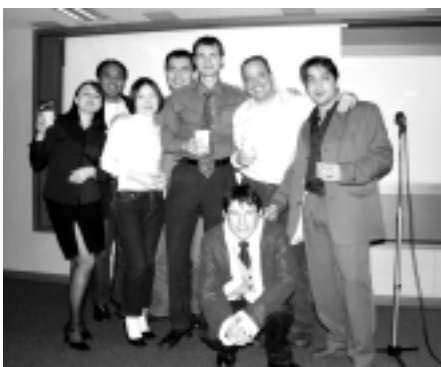
Friendship Night, with friends

I've been asked many times which things I have been most impressed by not only here at the KDI School but Korea in general. This is always a difficult question to answer, since I have been impressed with the whole experience, but if I were forced to choose the most impressive factor, I would have to say that it has been the people. In Korea, and at the KDI School, the greatness comes from the people themselves. Many people praise the Korean economic "miracle," as if it were something so complicated or inexplicable, but when you see the Koreans at work, you realize that the true miracle is in the people themselves.