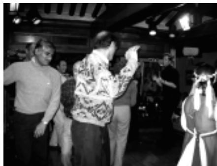
Dancing to Korean rhythms