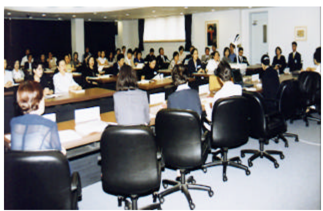
1999 International Conference

The conference was concluded with a consensus in the audience that the KDI School continue to play a leading role as an initiator of such effort, to keep in close touch with everyone and organize future meetings to further discuss the details of the issues that were brought up during the conference. —