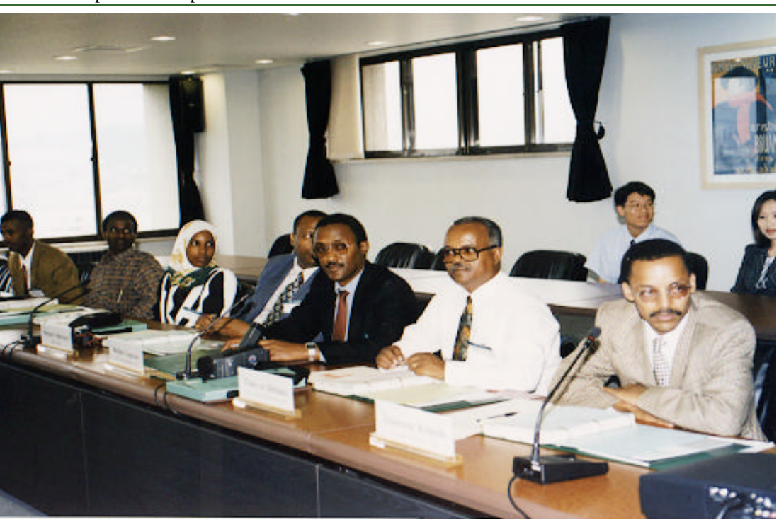
Participants of the Special Program on Trade Promotion Strategies for Ethiopia, on Opening Day