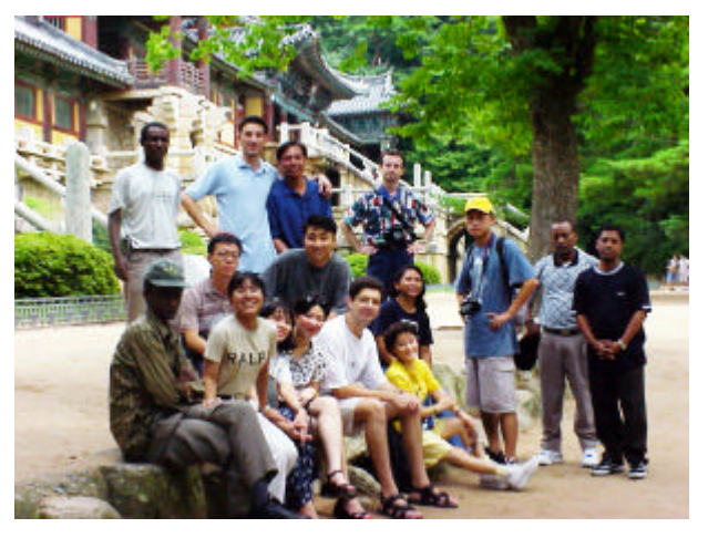
At the Bulkuk-sa temple

International students also went on a seven-day long Domestic Field Research & Study to Kyung-ju, Kumi & Suwon. —