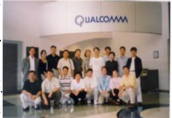
KDI School students during their field trip to the U.S.

Of course, as with all trips, there was also a fun component, with visits to