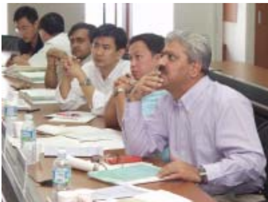
Participants at the WTO seminar.

However, not all the events in the workshop involved such serious and academic matters. The organizers of the event also included cultural trips to such touristic sights, such as the Yongin Korean Folk Village, the Seoul World Cup Stadium and the city of Kyungju.