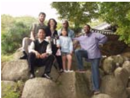
KDI School students pose for a group picture in the middle of their Korean field trip.