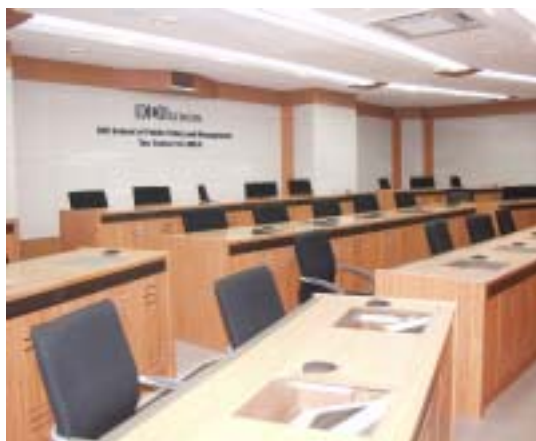
GDLN's videoconference room on the 3rd floor of KDI School's main building.

wide, GDLN aims to have countries share knowledge between each other, even if they are at two different ends of the globe, through distance learning activi-