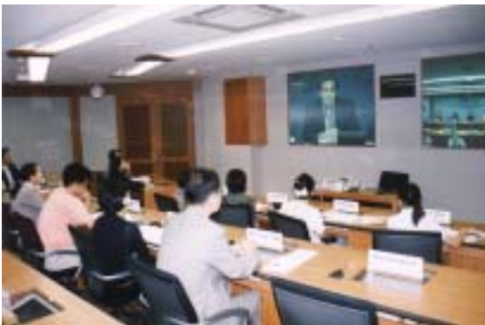
GDLN Seminar on youth issues.

Five panelists based in Washington, D.C., U.S., gave presentations on youth-related topics and this was followed by a discussion among participants in GDLN centers in Mongolia, Sri Lanka, Vietnam, and of course,