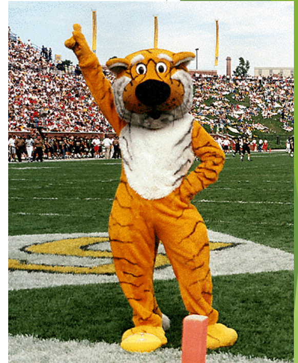
MU Mascot "Truman"