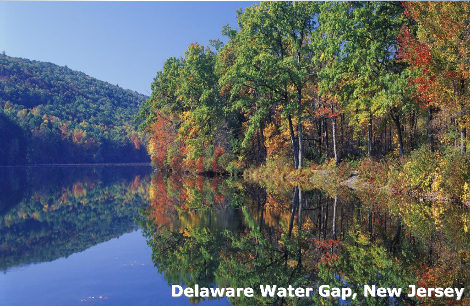
Delaware Water Gap, New Jersey