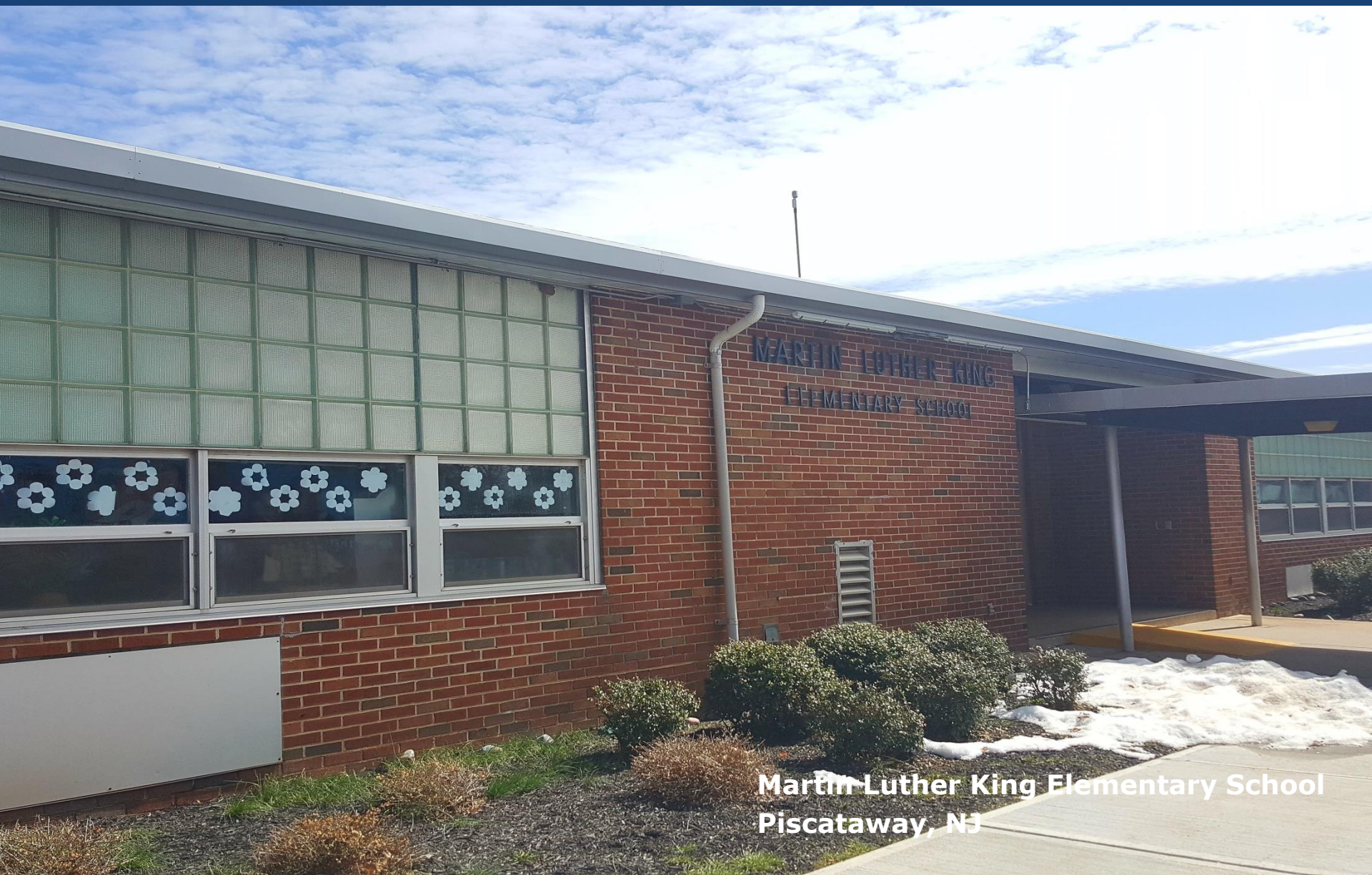
Martin Luther King Elementary School Piscataway, NJ