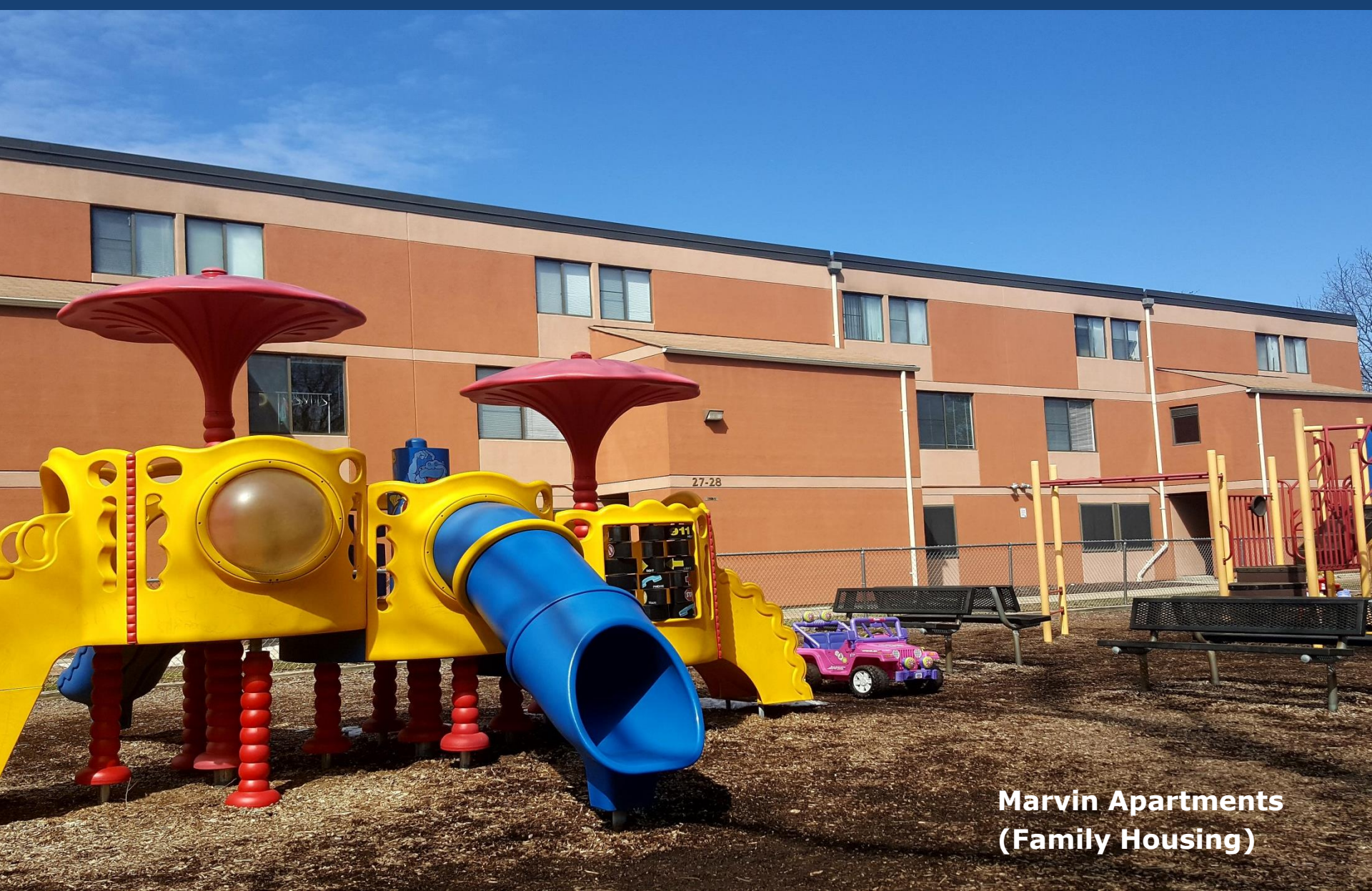
Marvin Apartments (Family Housing)