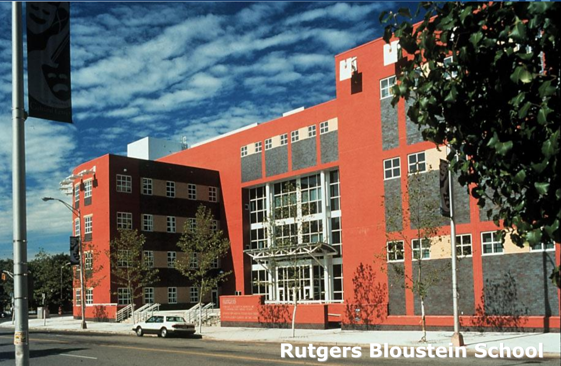
Rutgers Bloustein School