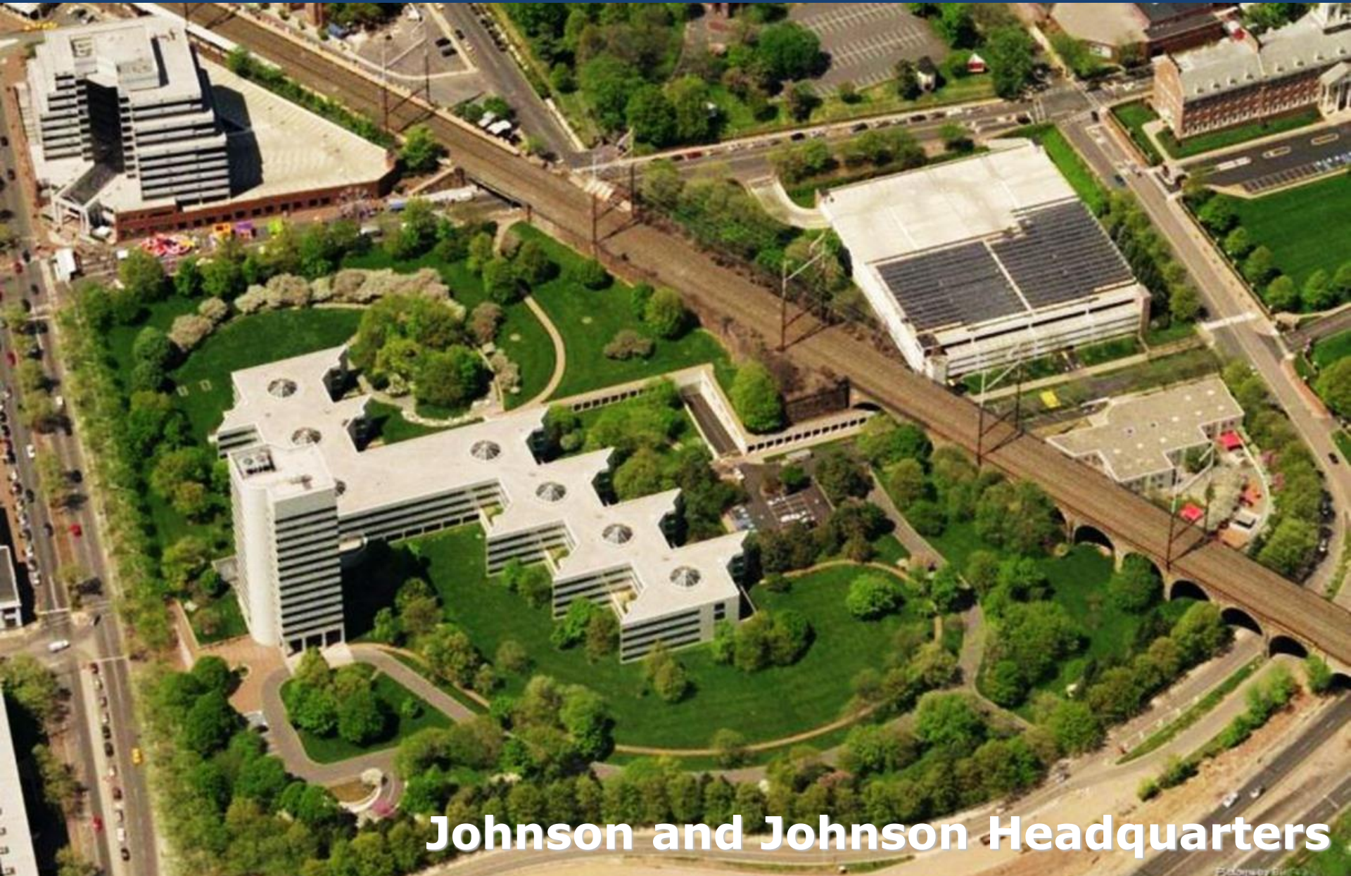
Johnson and Johnson Headquarters