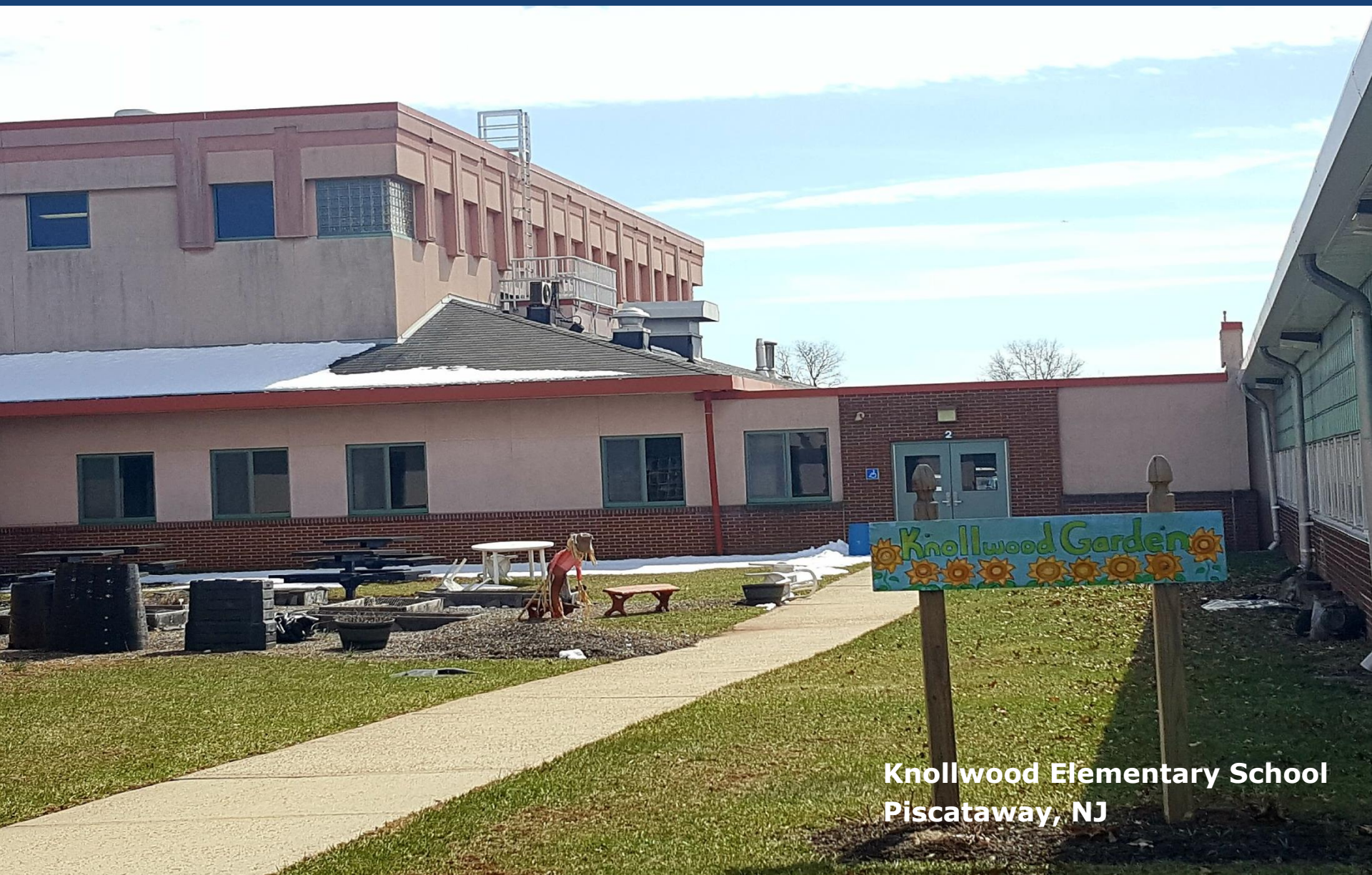
Knollwood Elementary School Piscataway, NJ