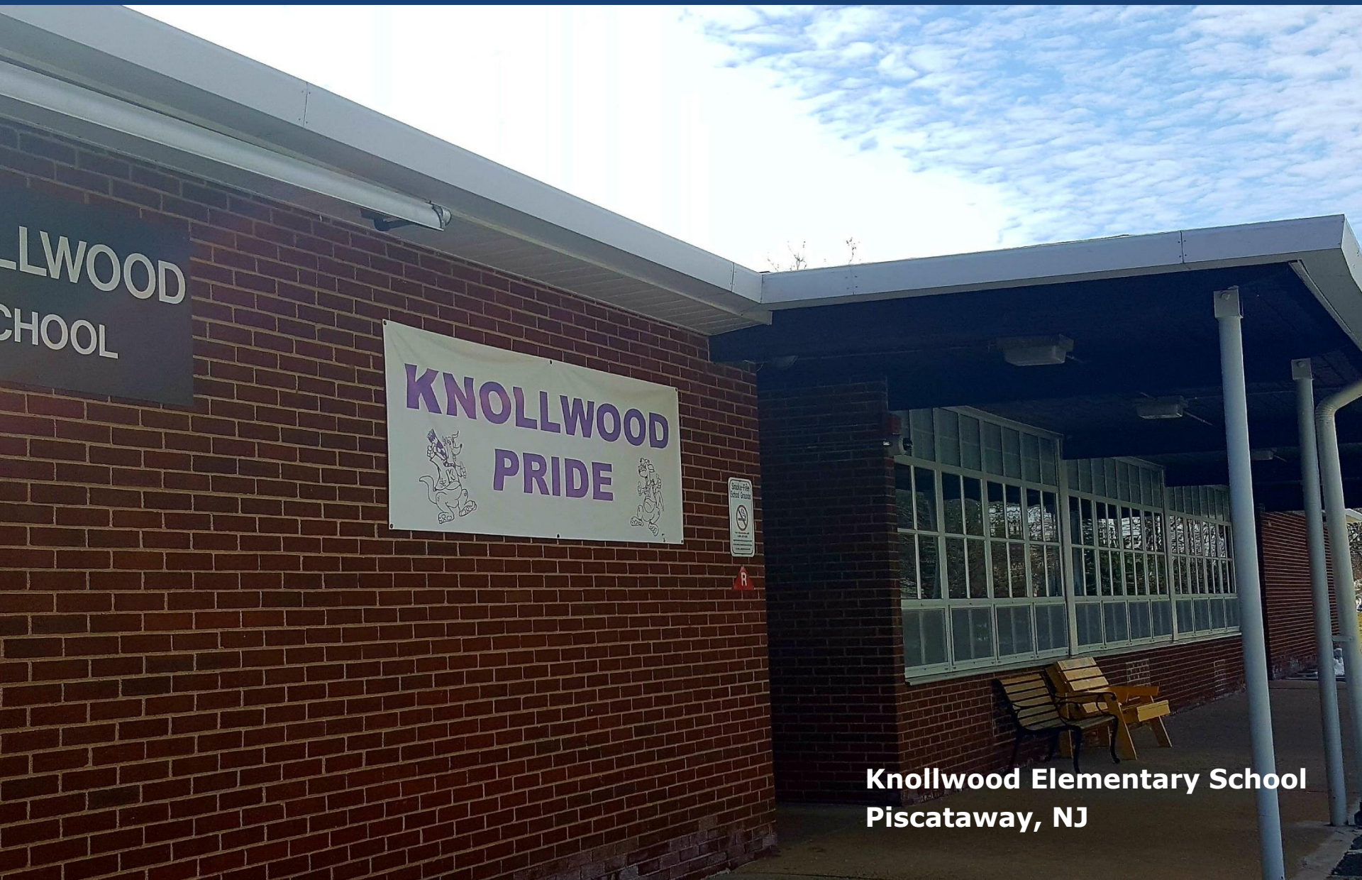
Knollwood Elementary School Piscataway, NJ