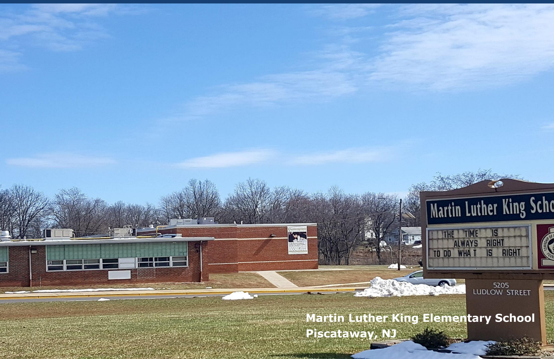
Martin Luther King Elementary School Piscataway, NJ