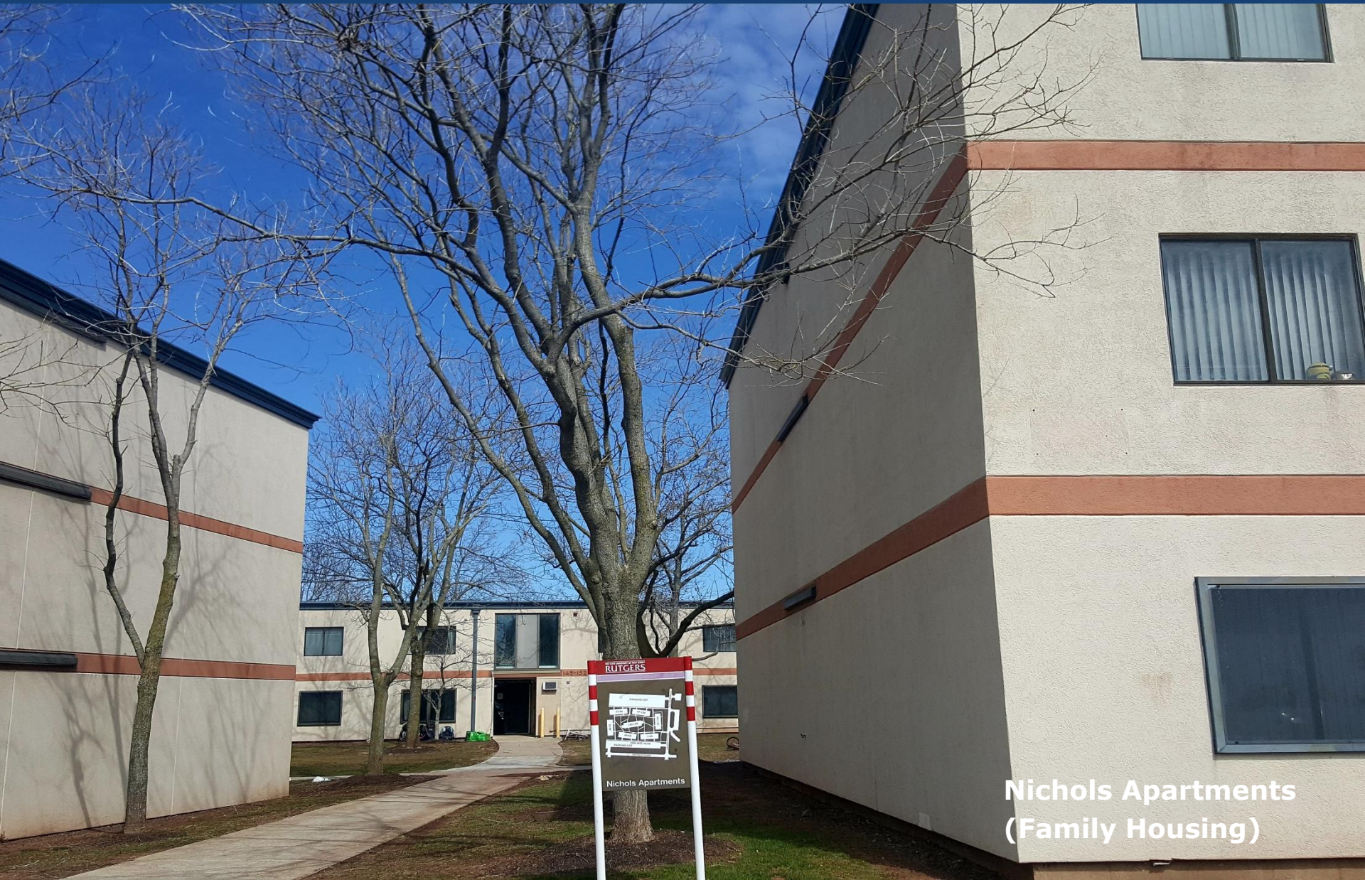
Nichols Apartments (Family Housing)