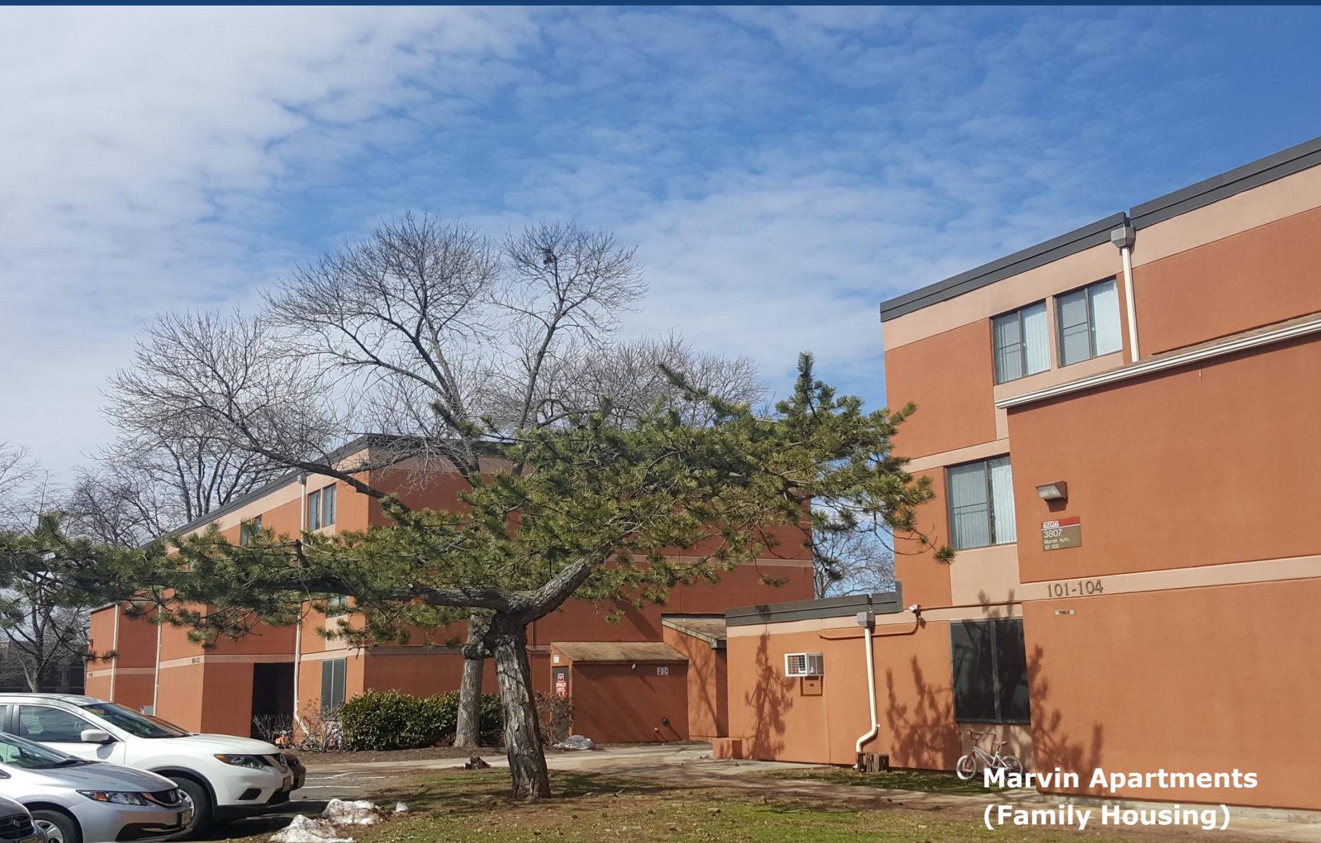
Marvin Apartments (Family Housing)