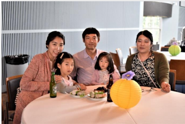
Spring End of Quarter Celebration

GLI brings together professionals and their families from all of our programs each quarter to socialize and celebrate!