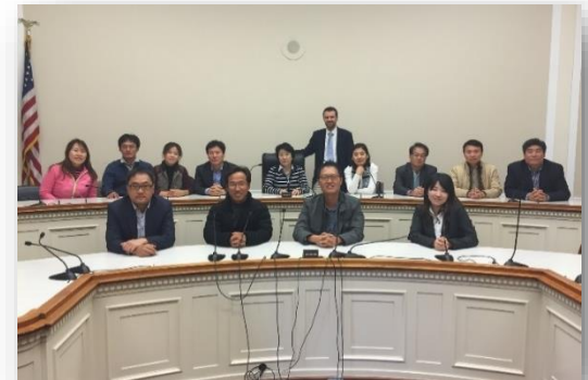
U.S. House of Representatives