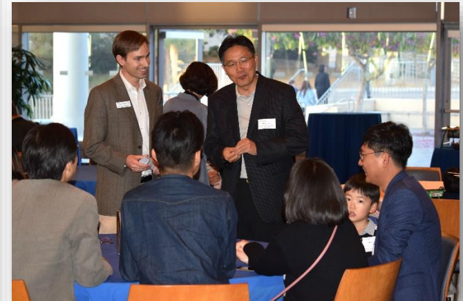
Winter Welcome and Celebration