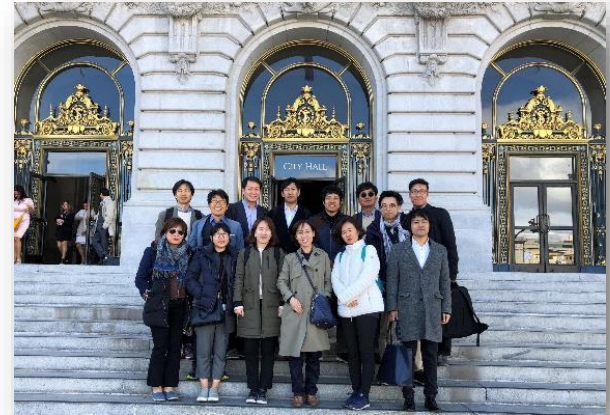
San Francisco Mayor's Office