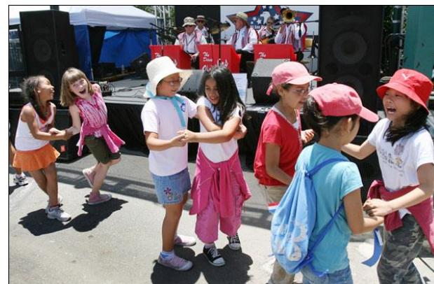
Students from Doyle Elementary enjoy a school field trip to the San Diego County Fair