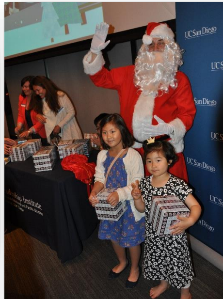
Fall End of Quarter Celebration