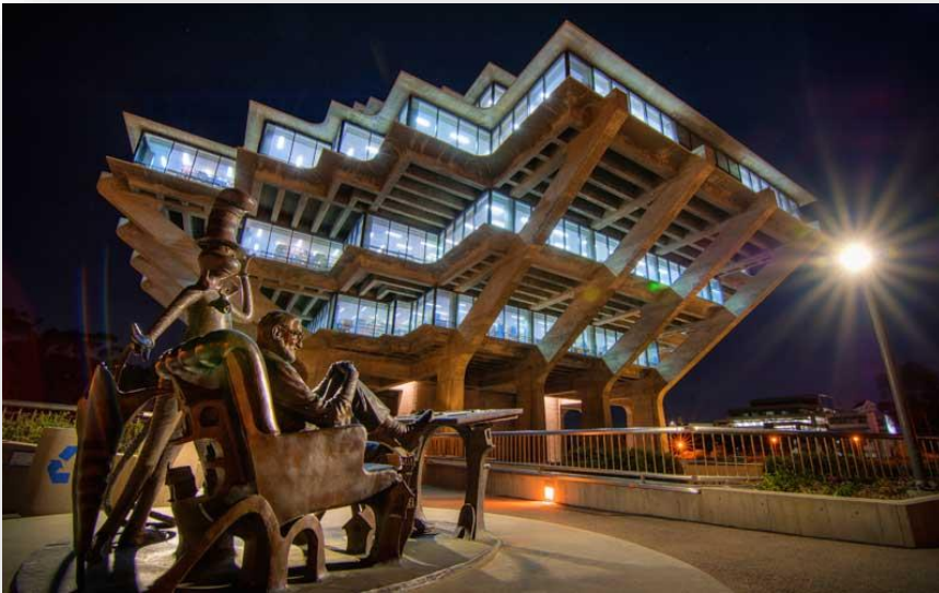
UC San Diego's Geisel Library