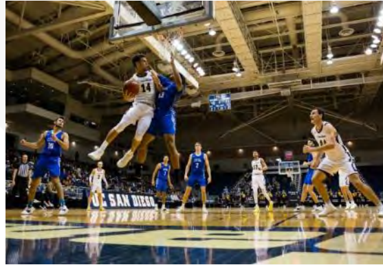
Tritons Men's Basketball Game