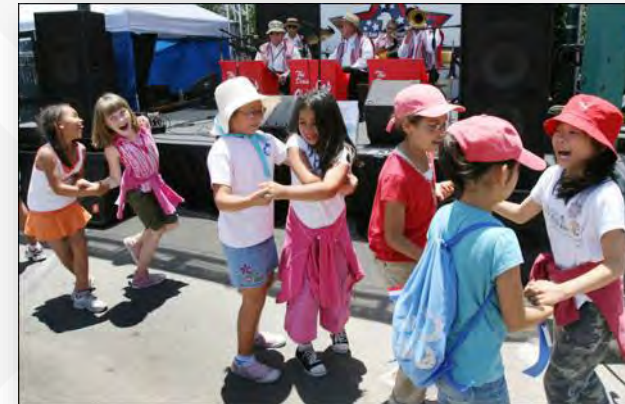
Students from Doyle Elementary enjoy a school field trip to the San Diego County Fair