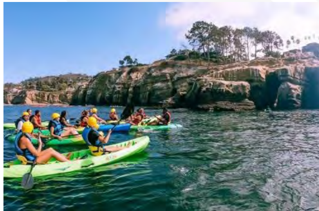
La Jolla Kayak Tours