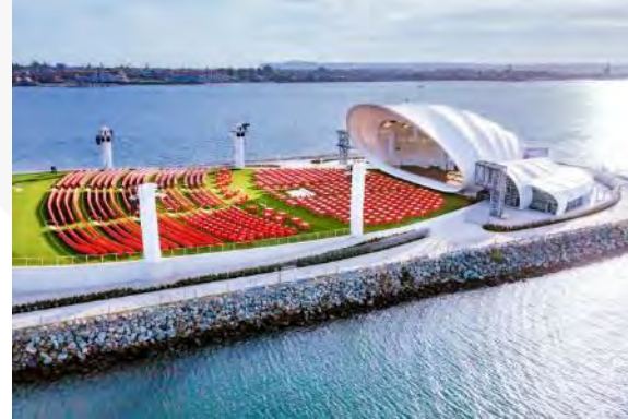
The Rady Shell at Jacobs Park