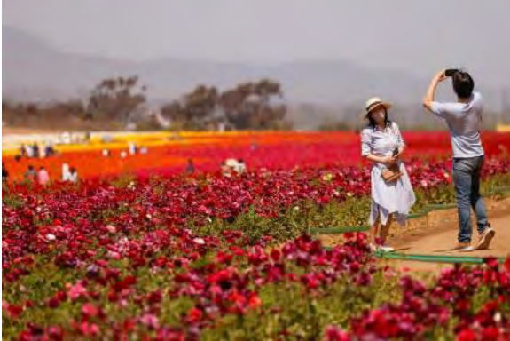
Carlsbad Flower Fields