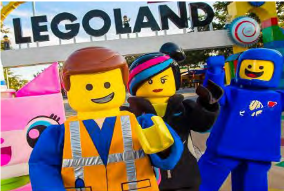
Legoland California Resort