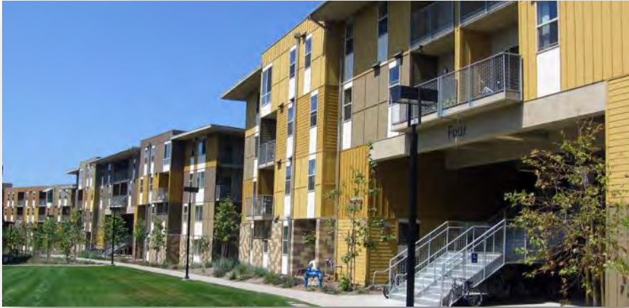
One Miramar Street Apartments