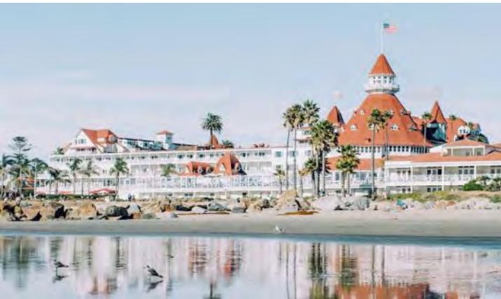
Hotel del Coronado