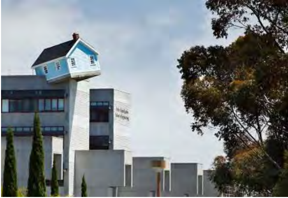
Fallen Star – Stuart Art Collection