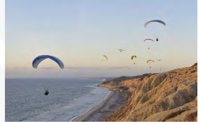
Paragliding at Torrey Pines Gliderport