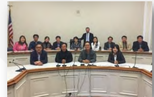
U.S. House of Representatives