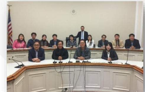
U.S. House of Representatives