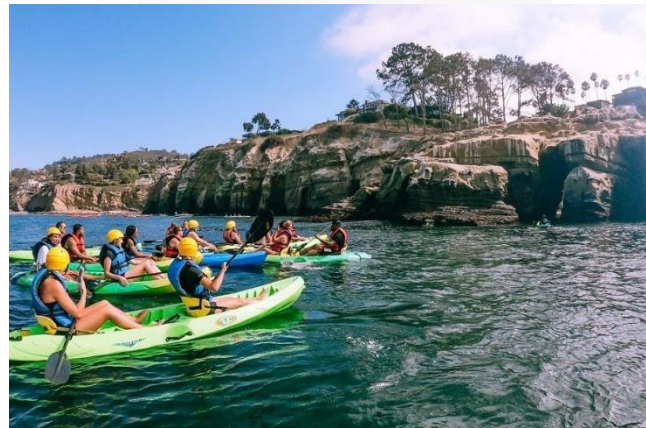
La Jolla Kayak Tours