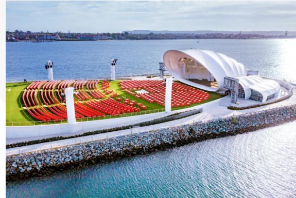
The Rady Shell at Jacobs Park