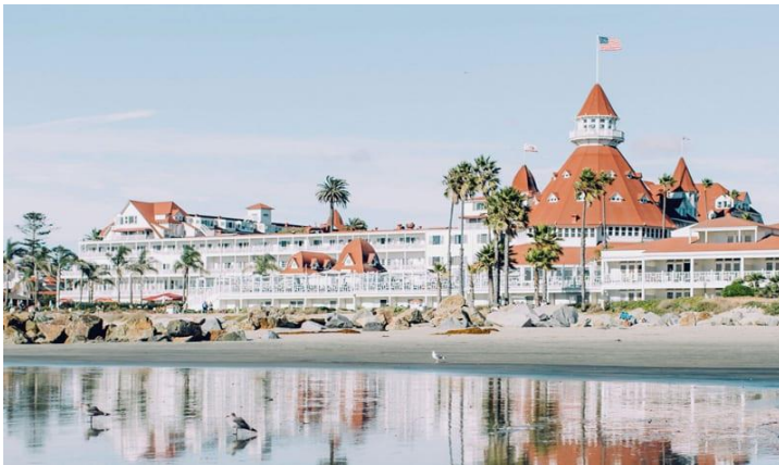
Hotel del Coronado