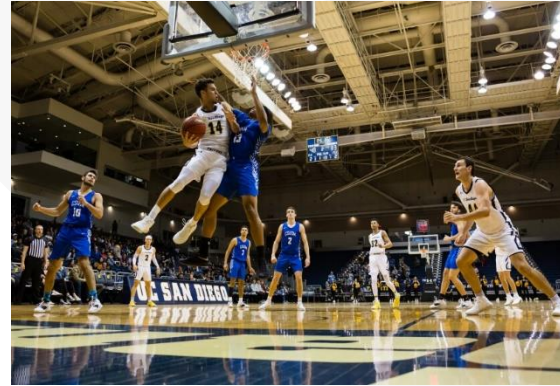
Tritons Men's Basketball Game