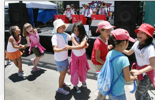
Students from Doyle Elementary enjoy a school field trip to the San Diego County Fair