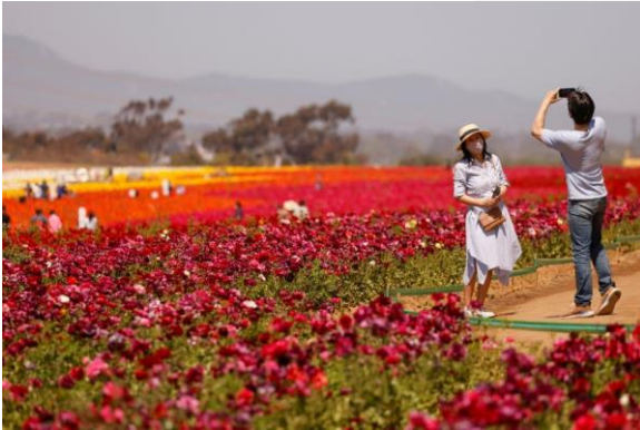
Carlsbad Flower Fields