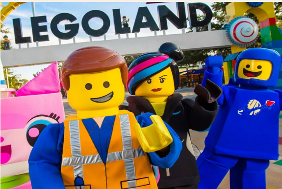
Legoland California Resort