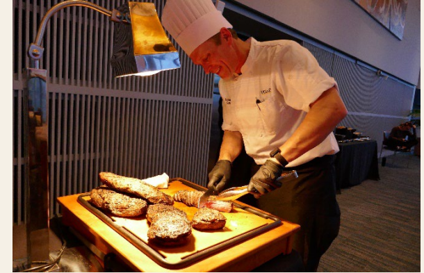
Winter 2024 Welcome Dinner