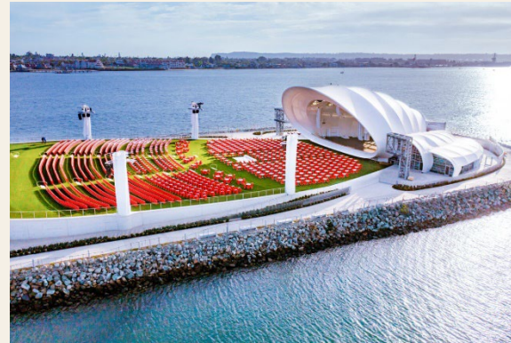
The Rady Shell at Jacobs Park