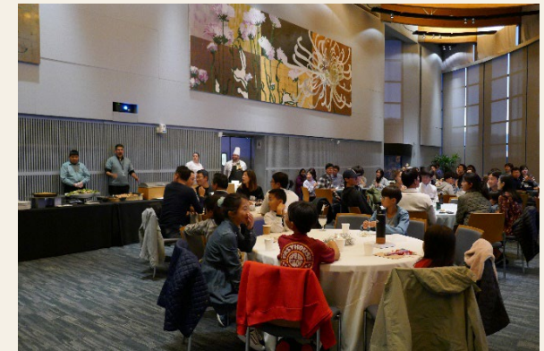
Fall 2023 End-of-Quarter Celebration