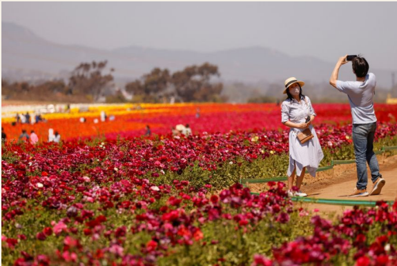
Carlsbad Flower Fields