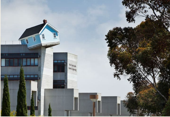
Fallen Star – Stuart Art Collection