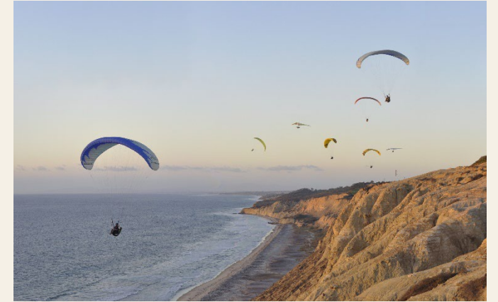
Paragliding at Torrey Pines Gliderport