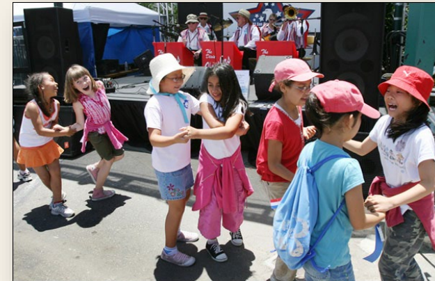
Students from Doyle Elementary enjoy a school field trip to the San Diego County Fair