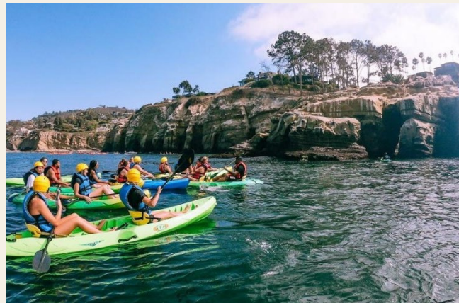
La Jolla Kayak Tours