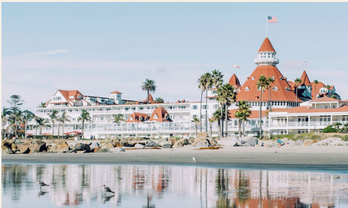
Hotel del Coronado