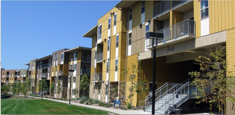
One Miramar Street Apartments