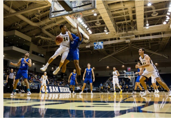
Tritons Men's Basketball Game