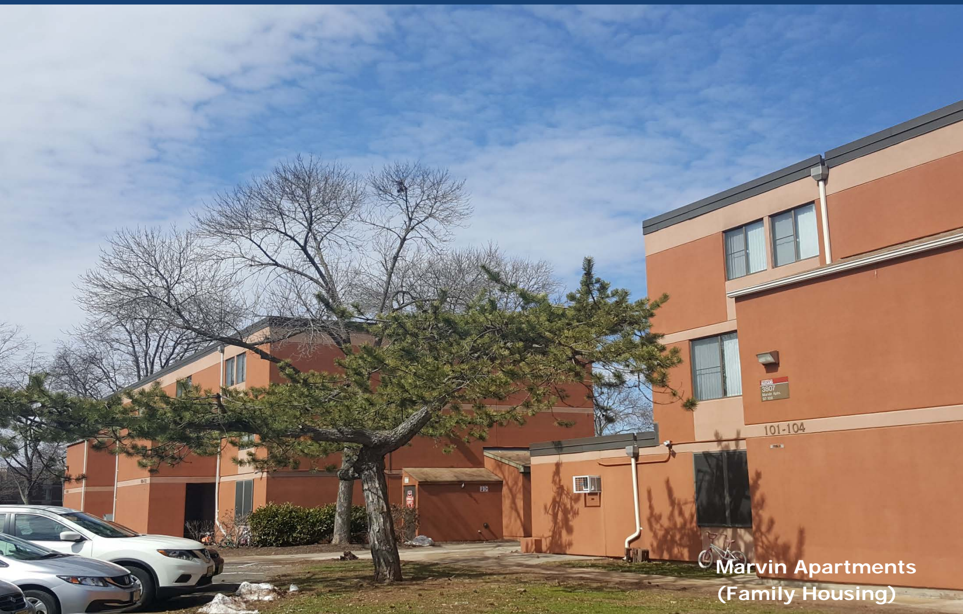
Marvin Apartments (Family Housing)