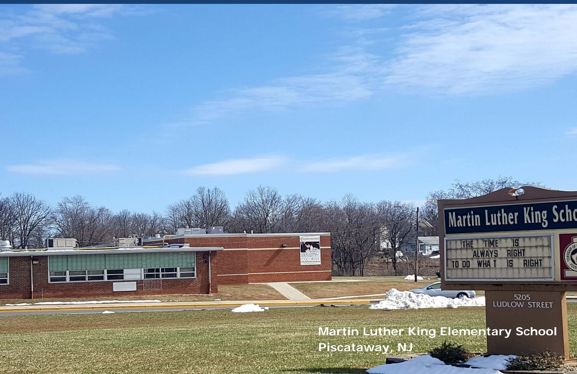
Martin Luther King Elementary School Piscataway, NJ