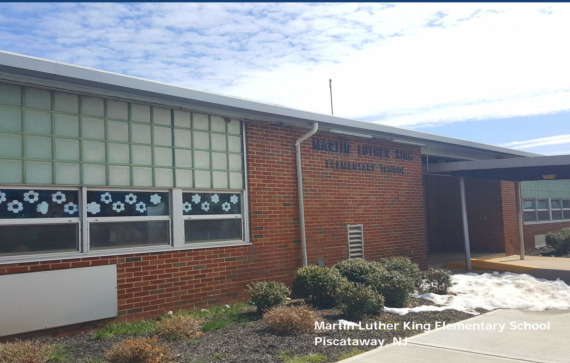
Martin Luther King Elementary School Piscataway, NJ