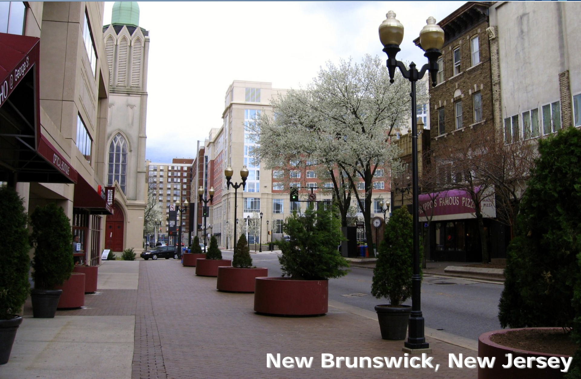
New Brunswick, New Jersey