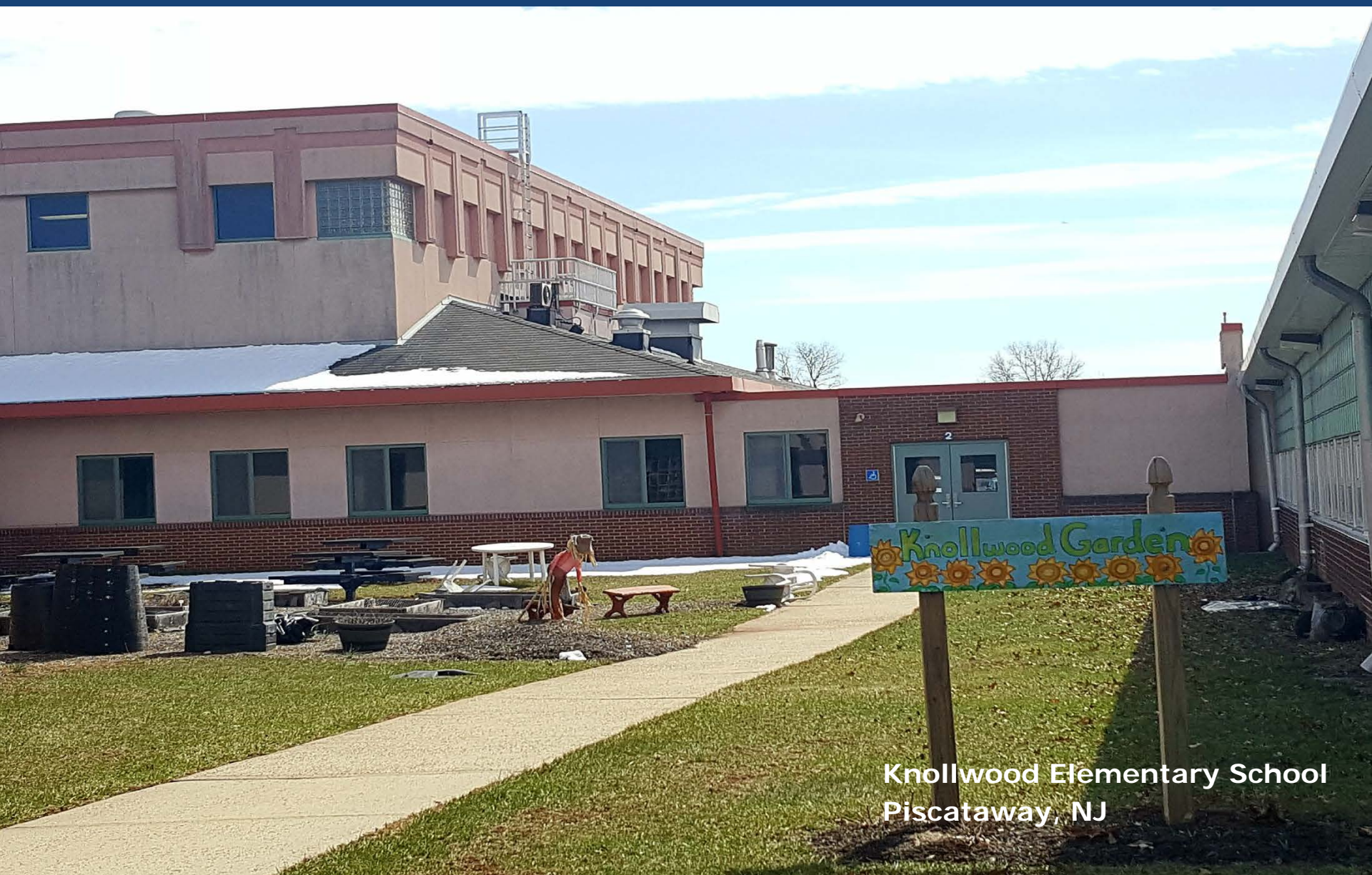
Knollwood Elementary School Piscataway, NJ