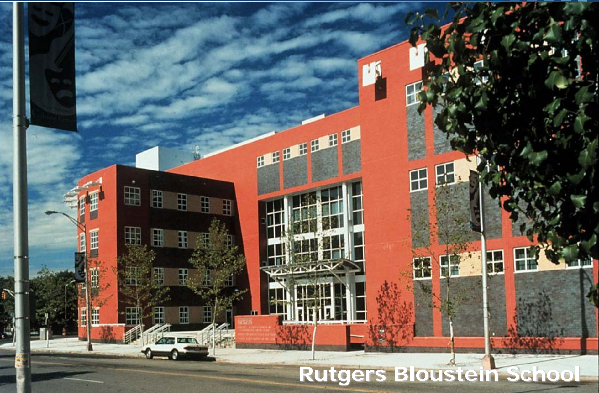
Rutgers Bloustein School