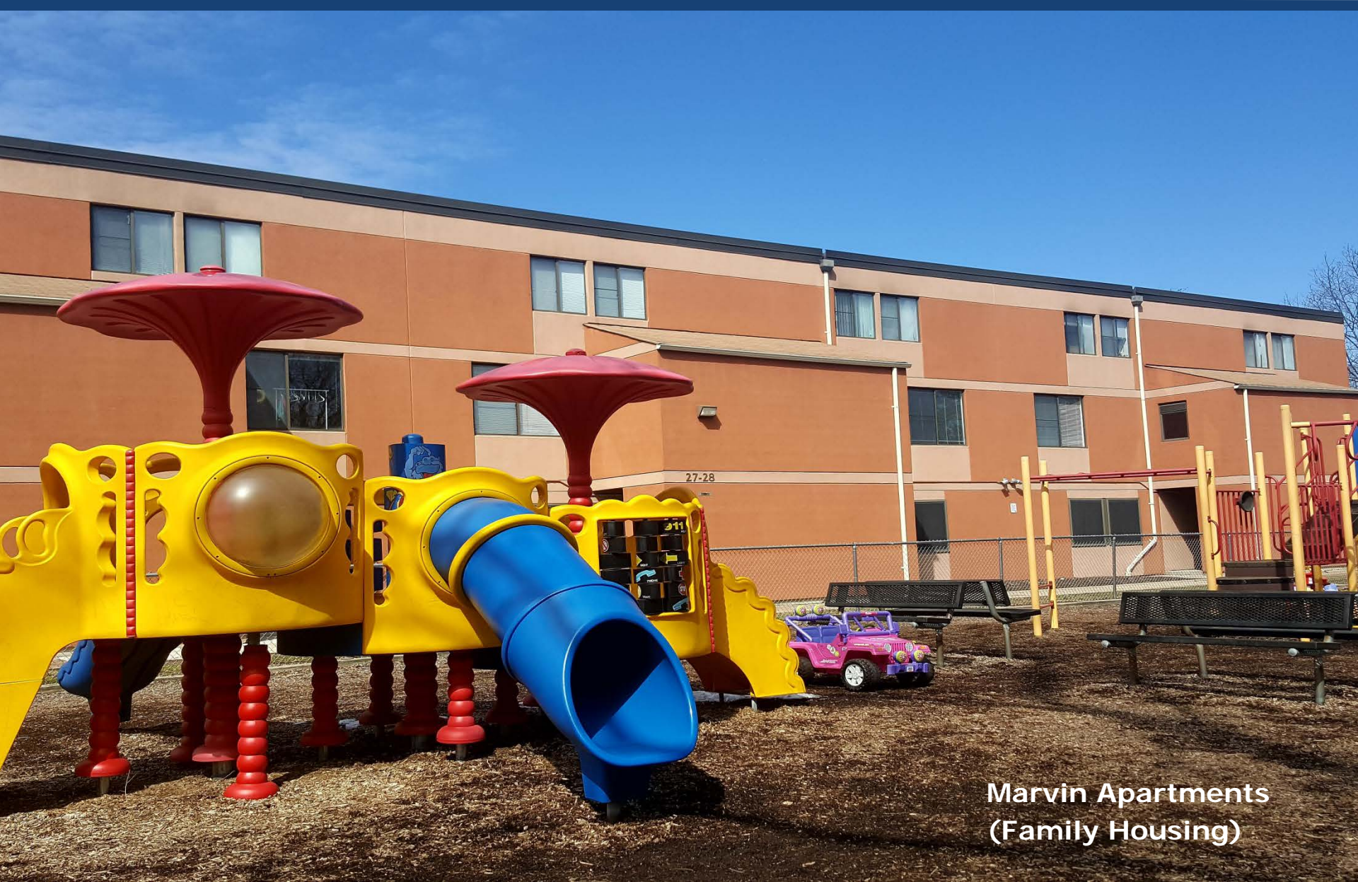
Marvin Apartments (Family Housing)