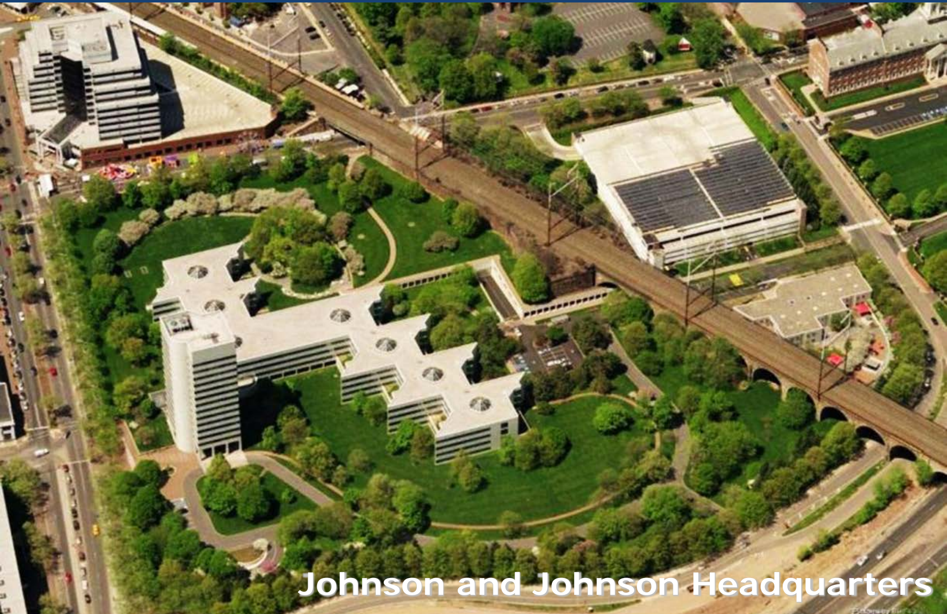
Johnson and Johnson Headquarters