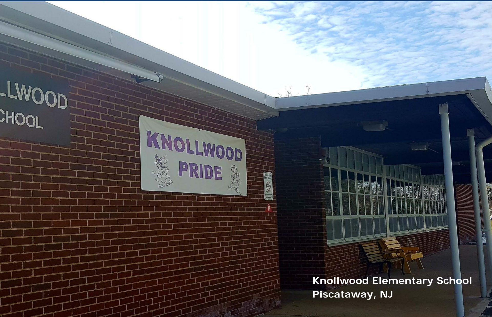
Knollwood Elementary School Piscataway, NJ