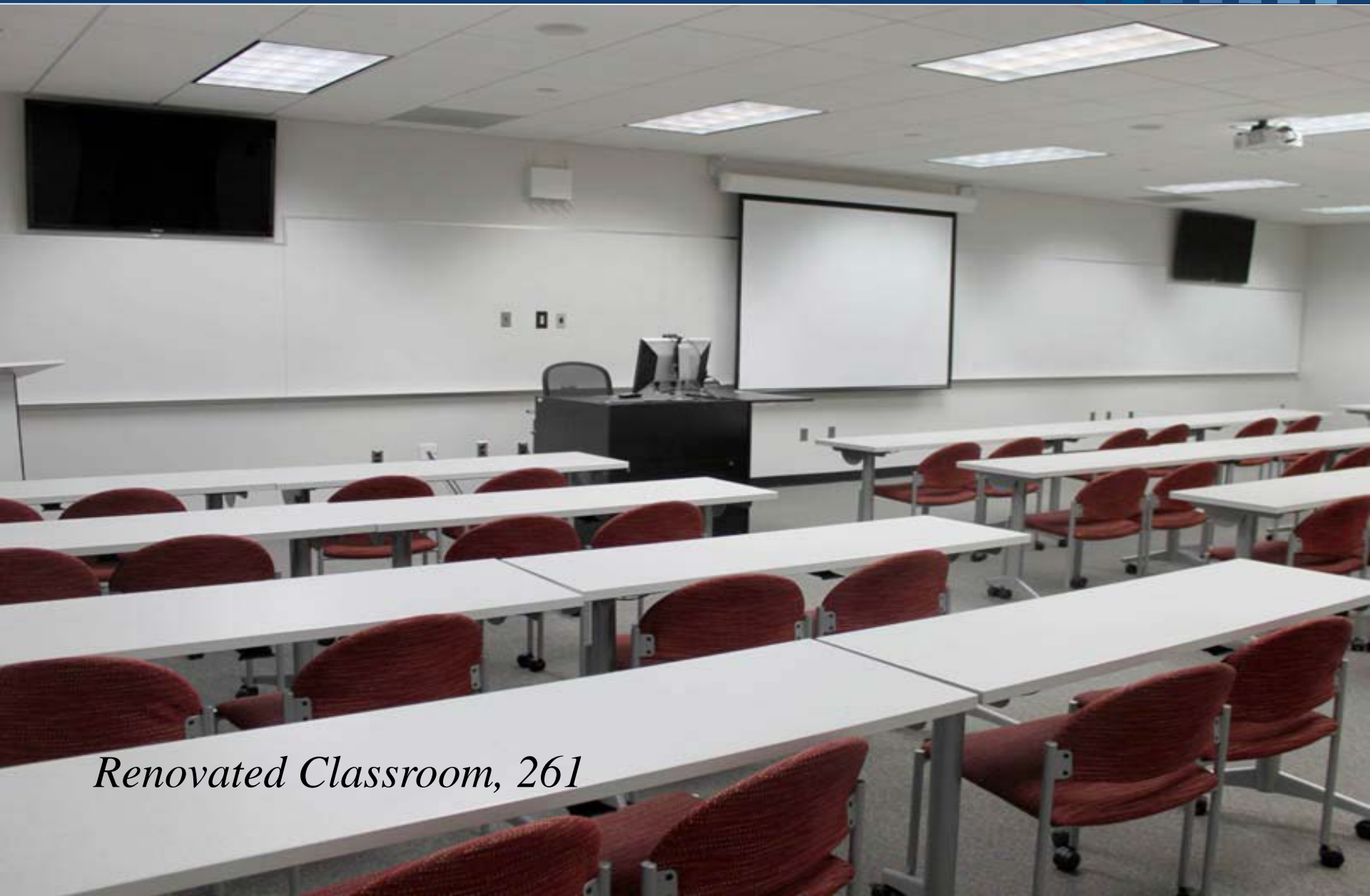
Renovated Classroom, 261