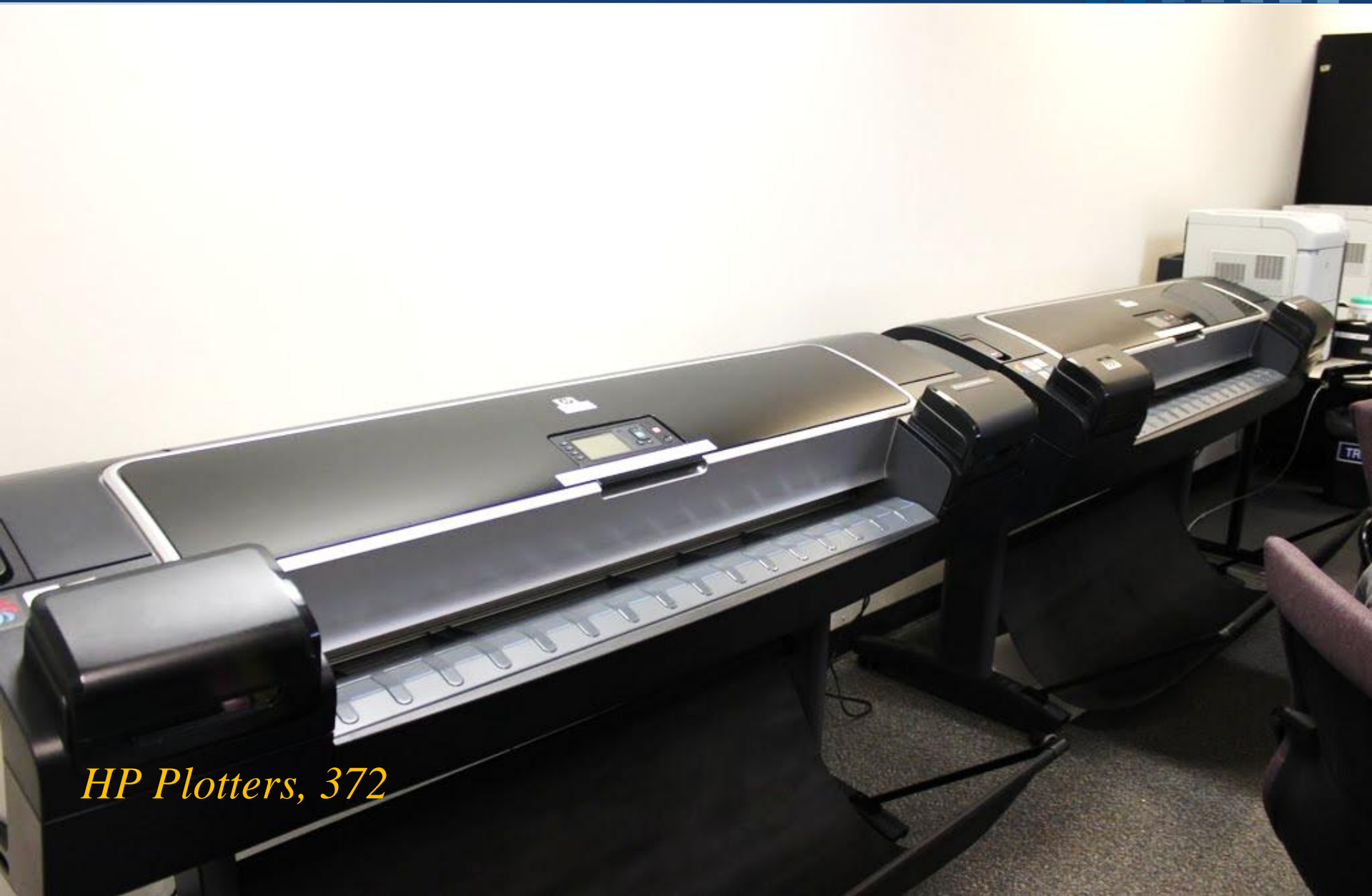
HP Plotters, 372