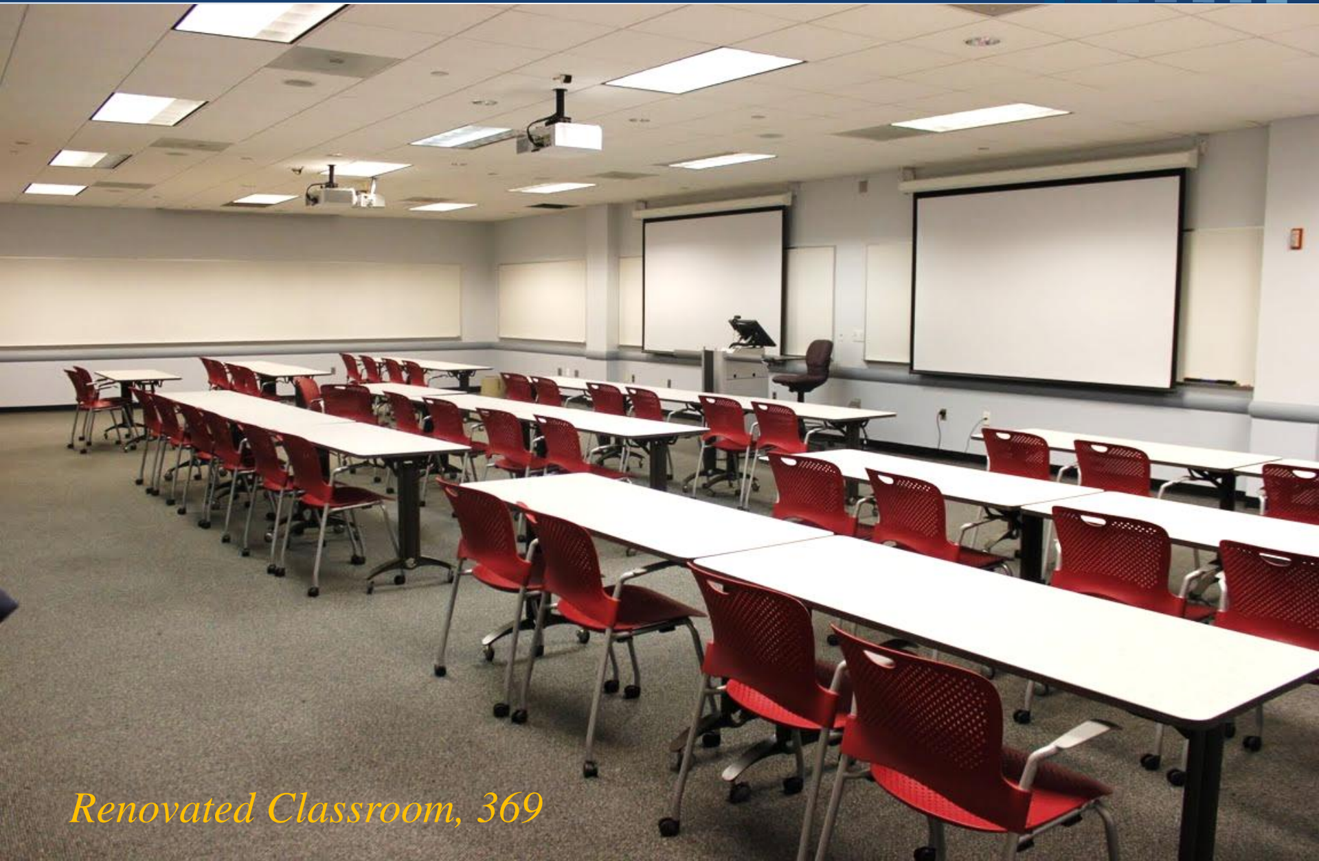
Renovated Classroom, 369