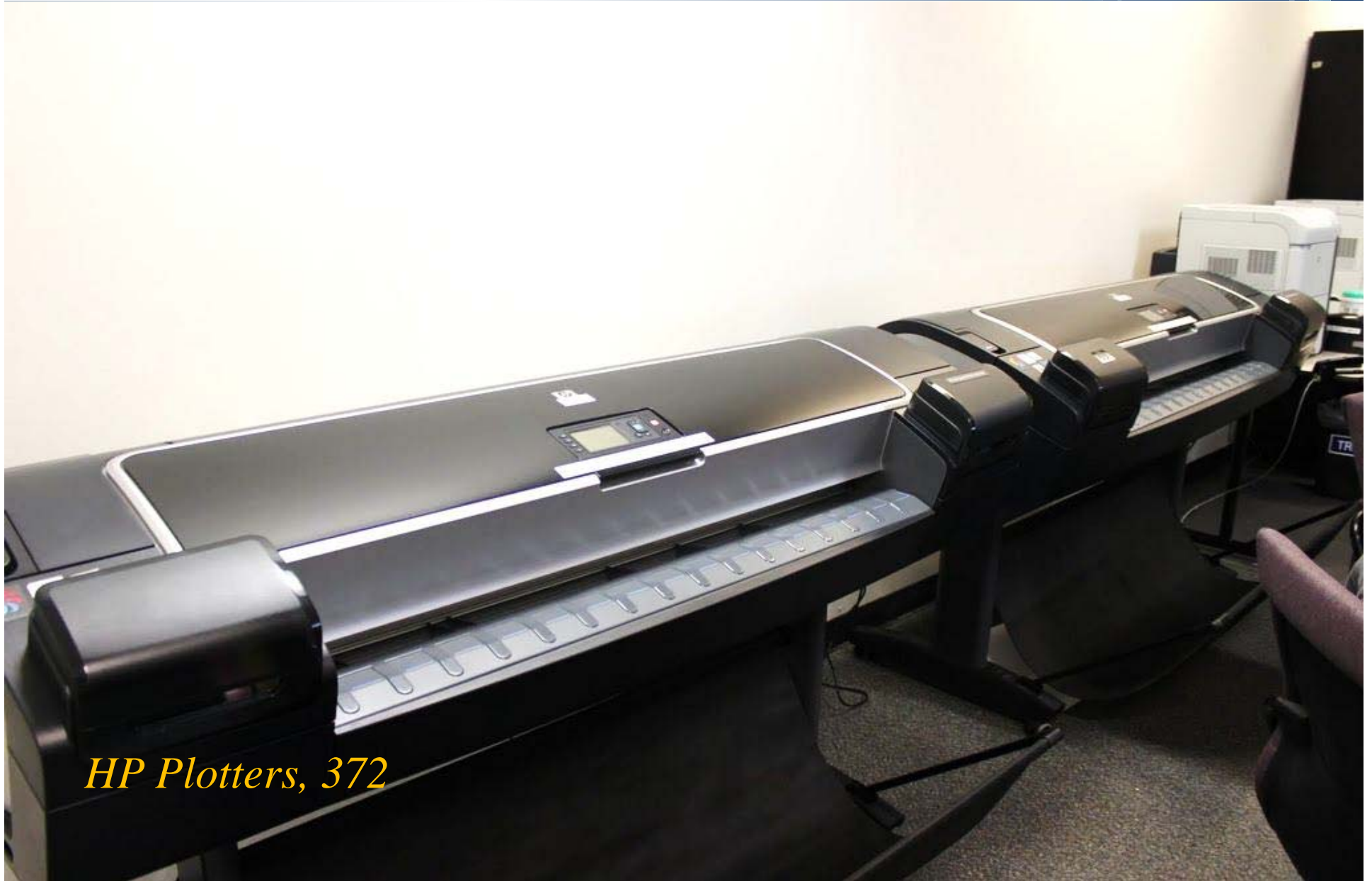
HP Plotters, 372