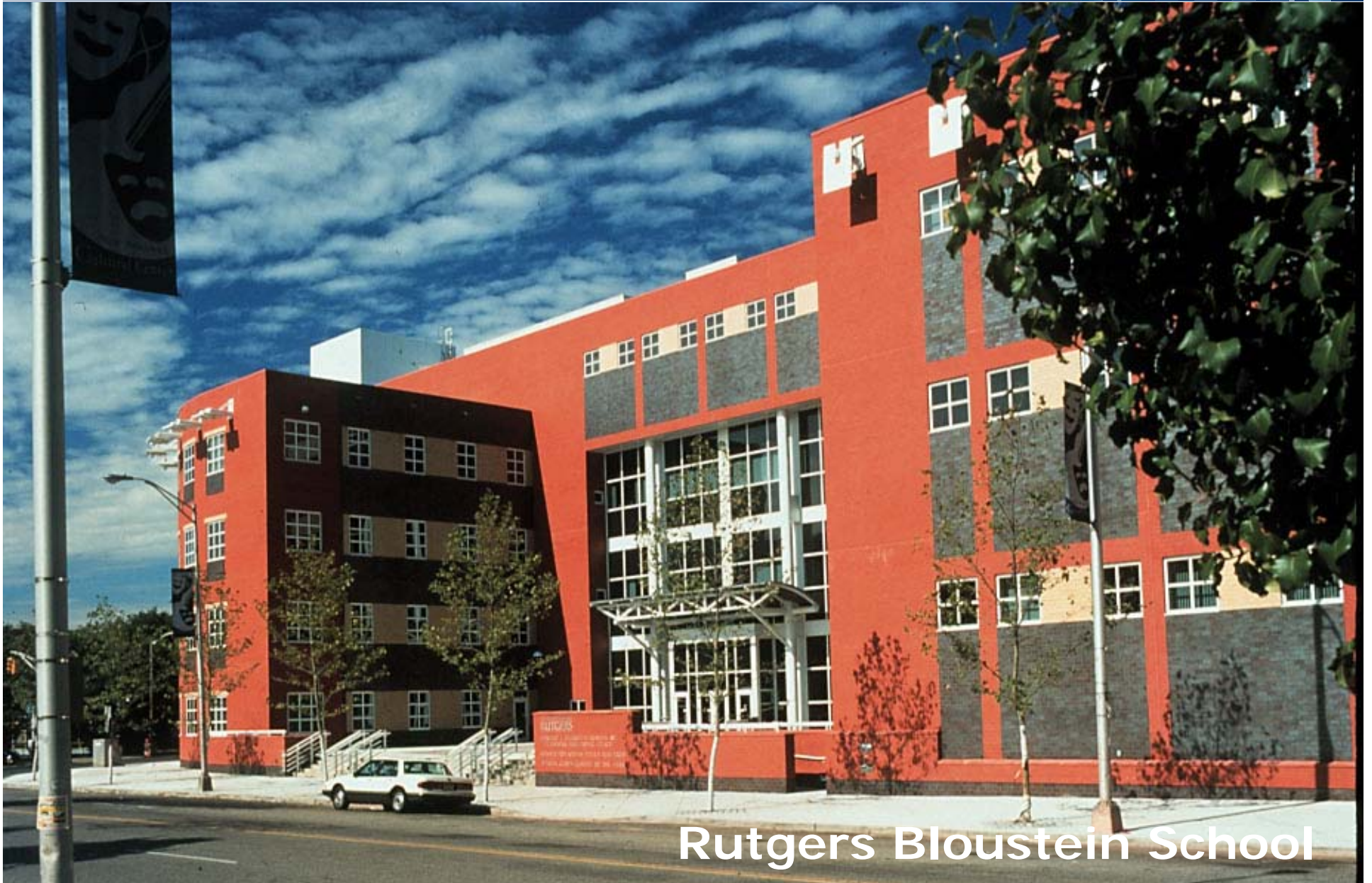
Rutgers Bloustein School