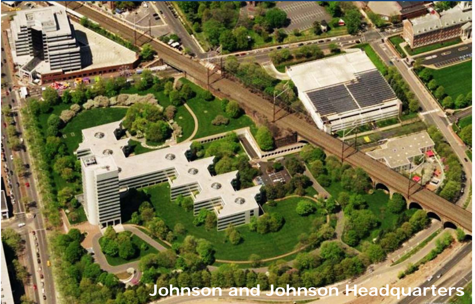
Johnson and Johnson Headquarters