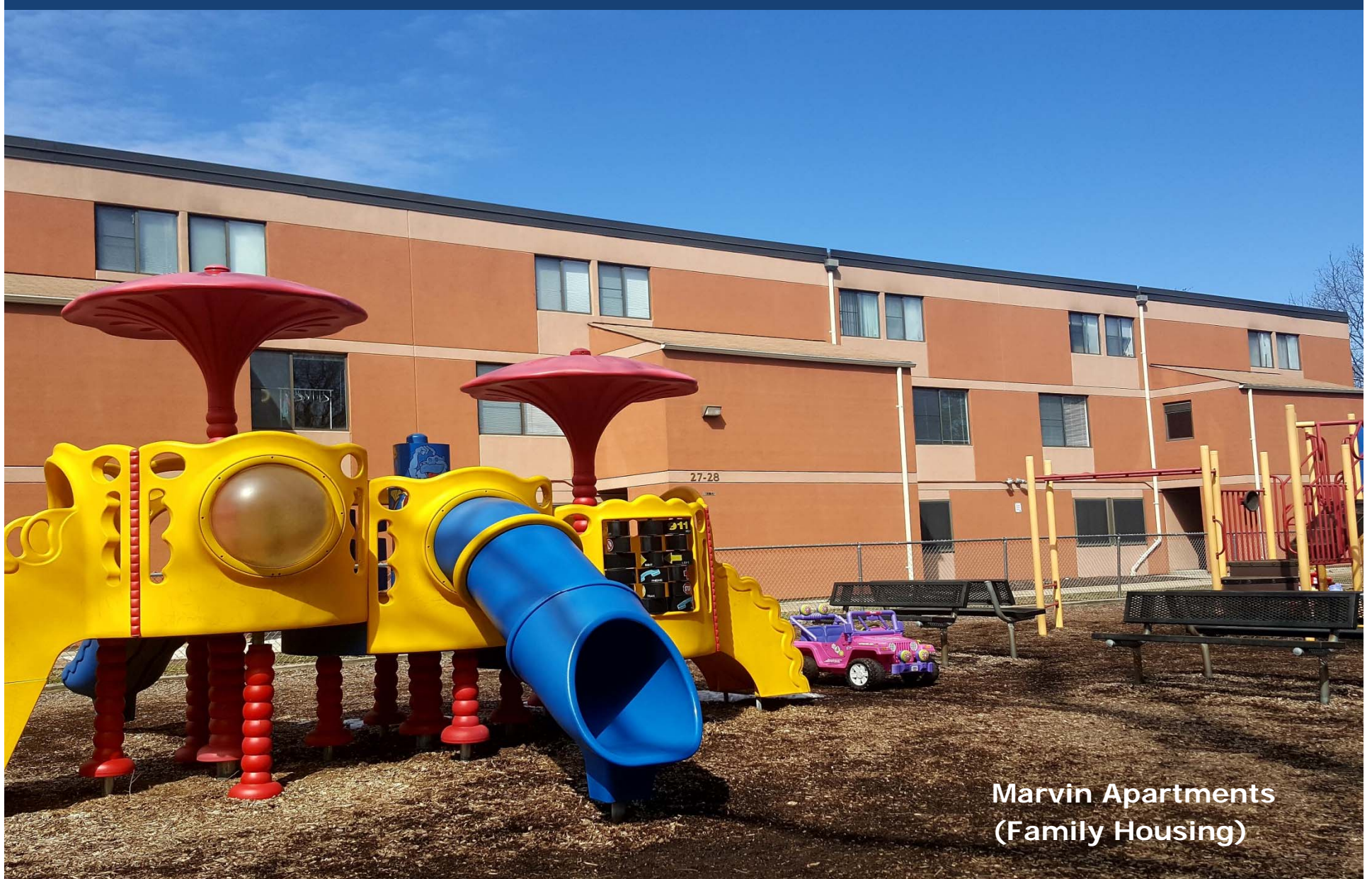
Marvin Apartments (Family Housing)