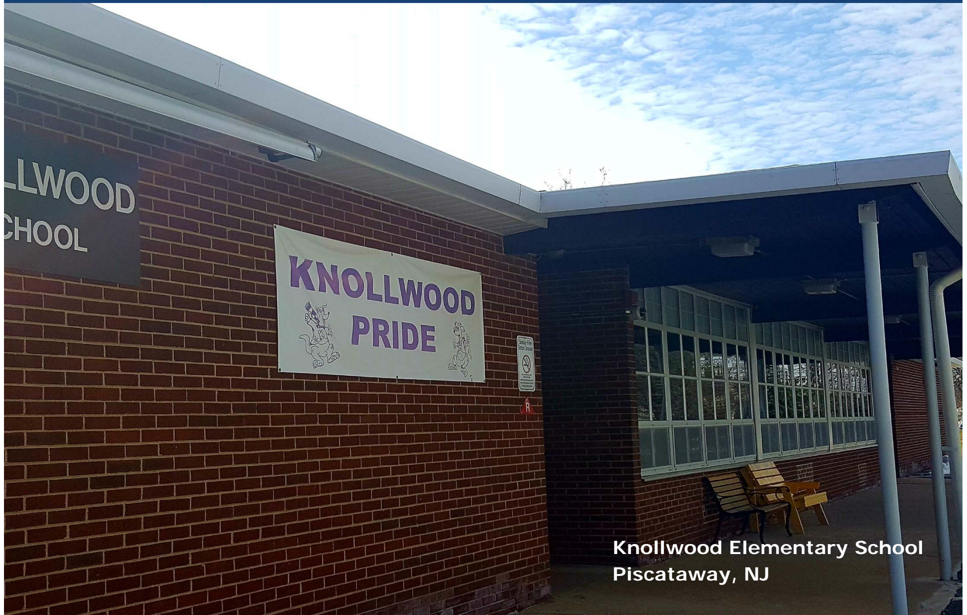
Knollwood Elementary School Piscataway, NJ