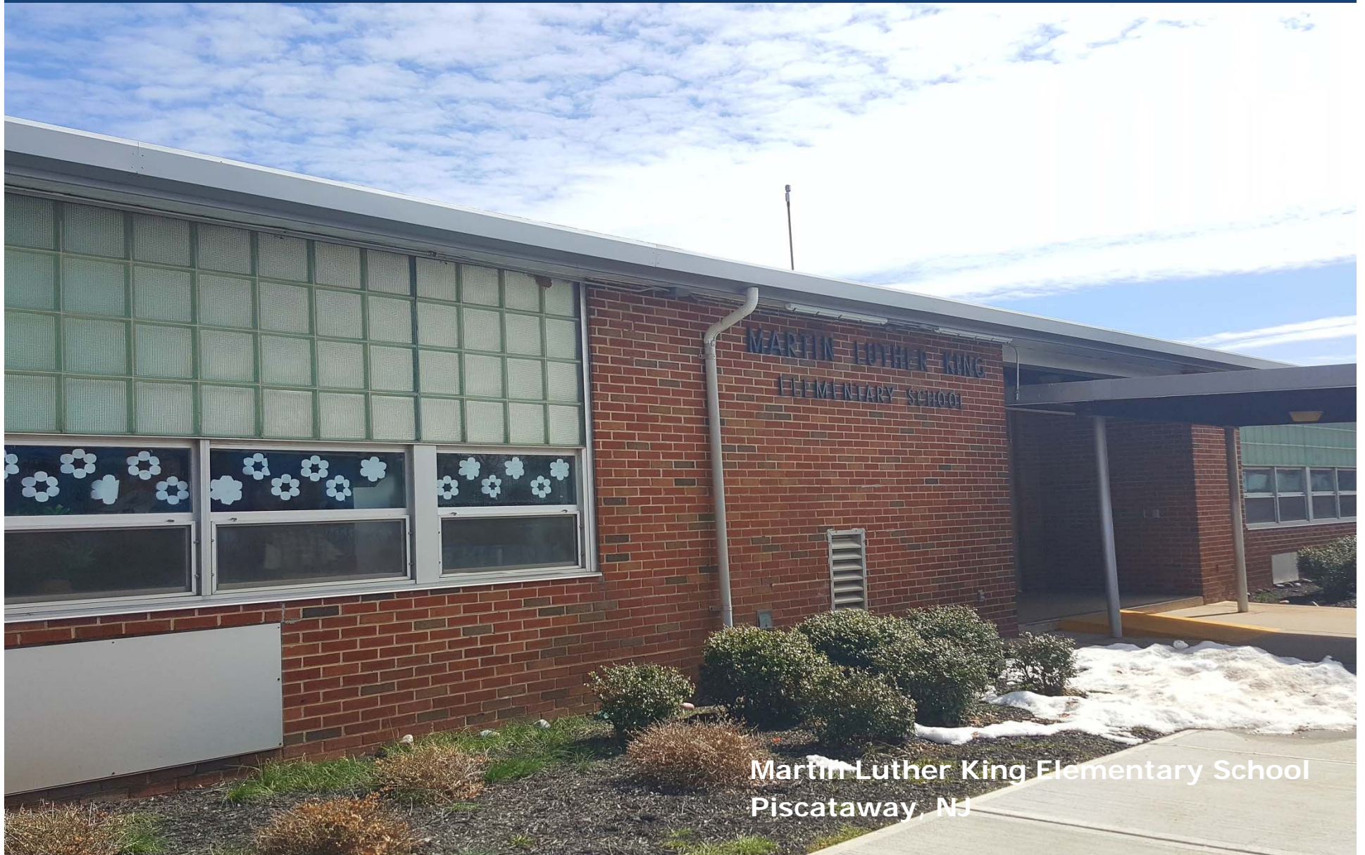
Martin Luther King Elementary School Piscataway, NJ