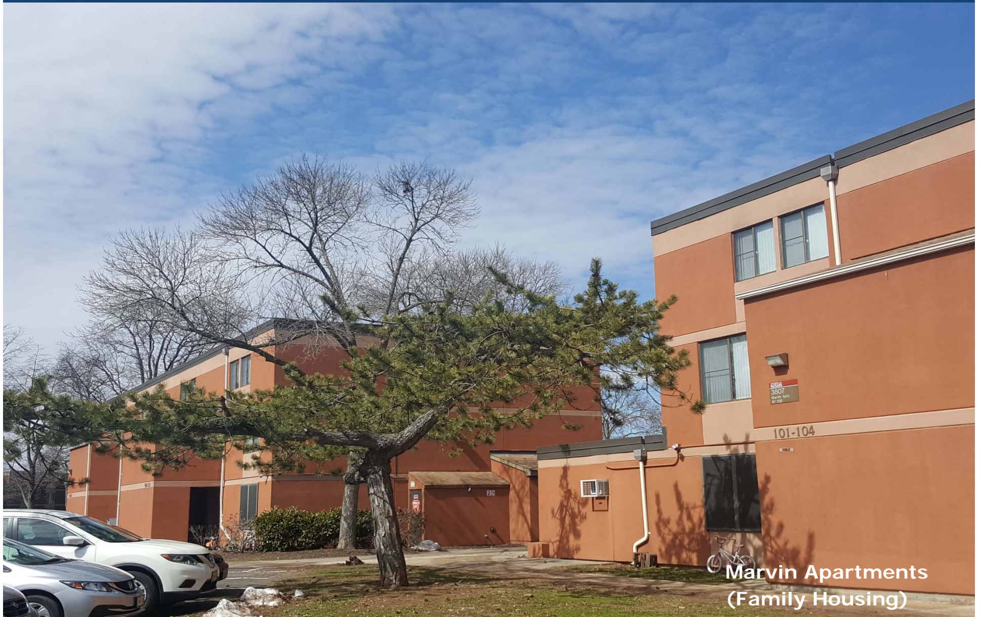
Marvin Apartments (Family Housing)