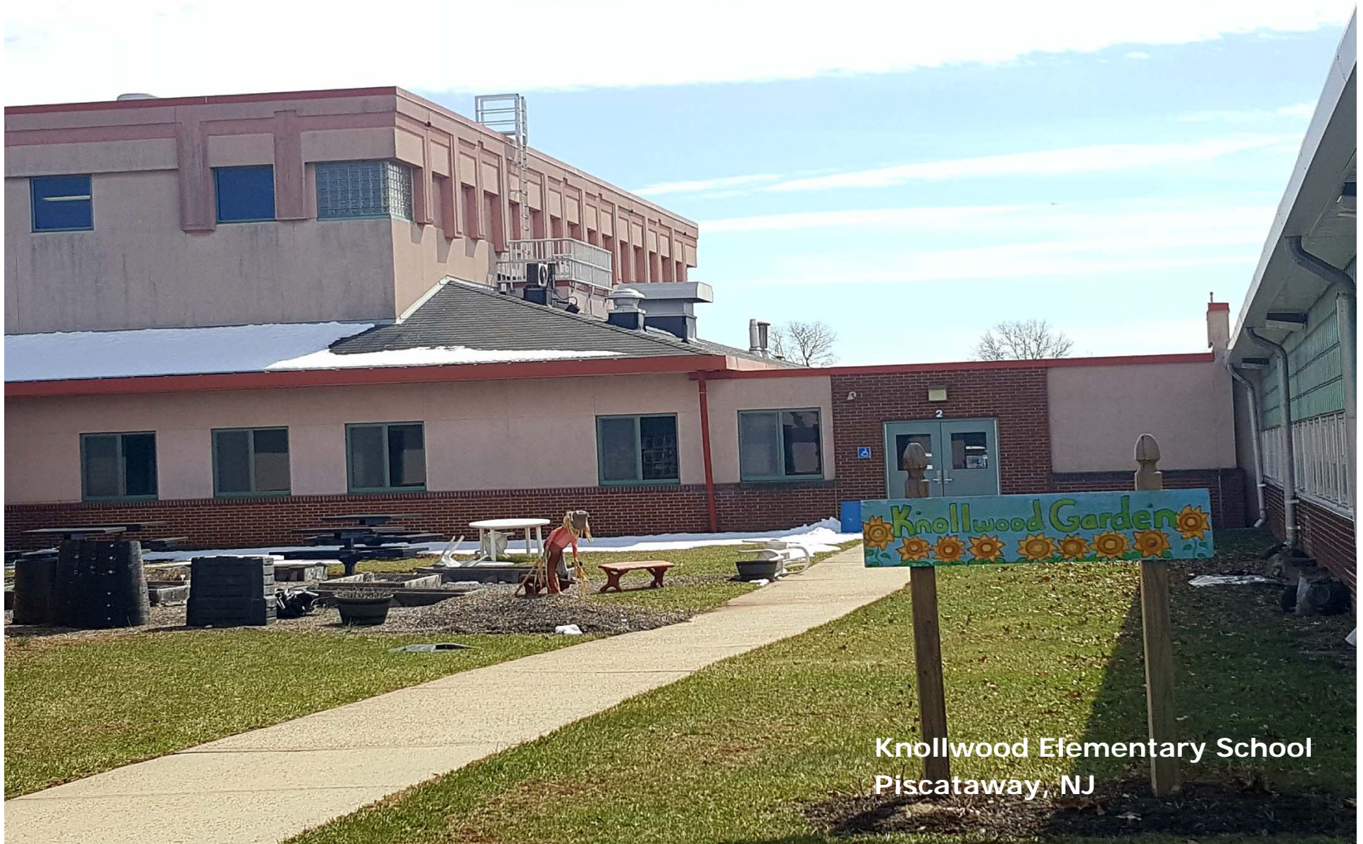
Knollwood Elementary School Piscataway, NJ