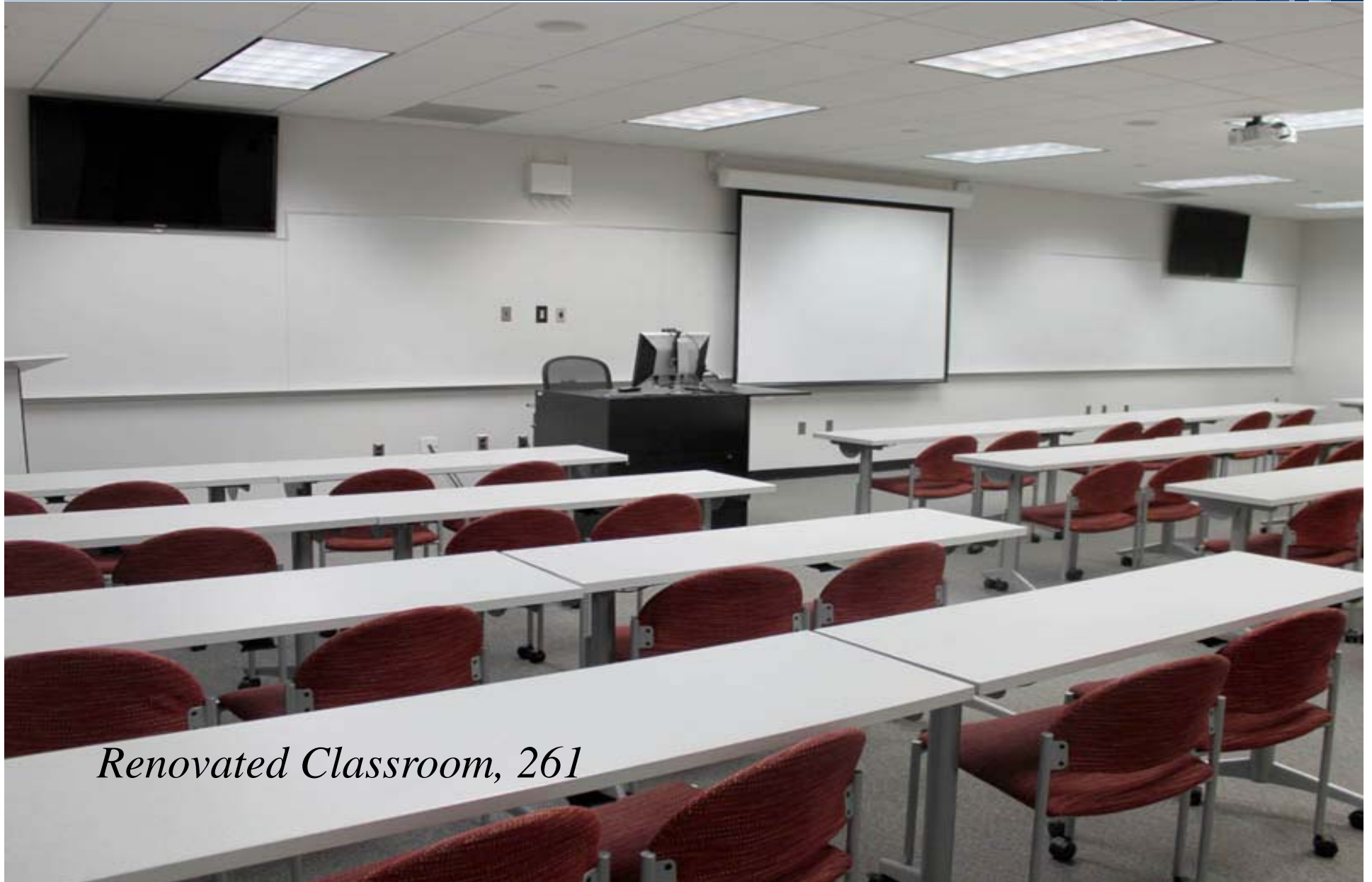
Renovated Classroom, 261