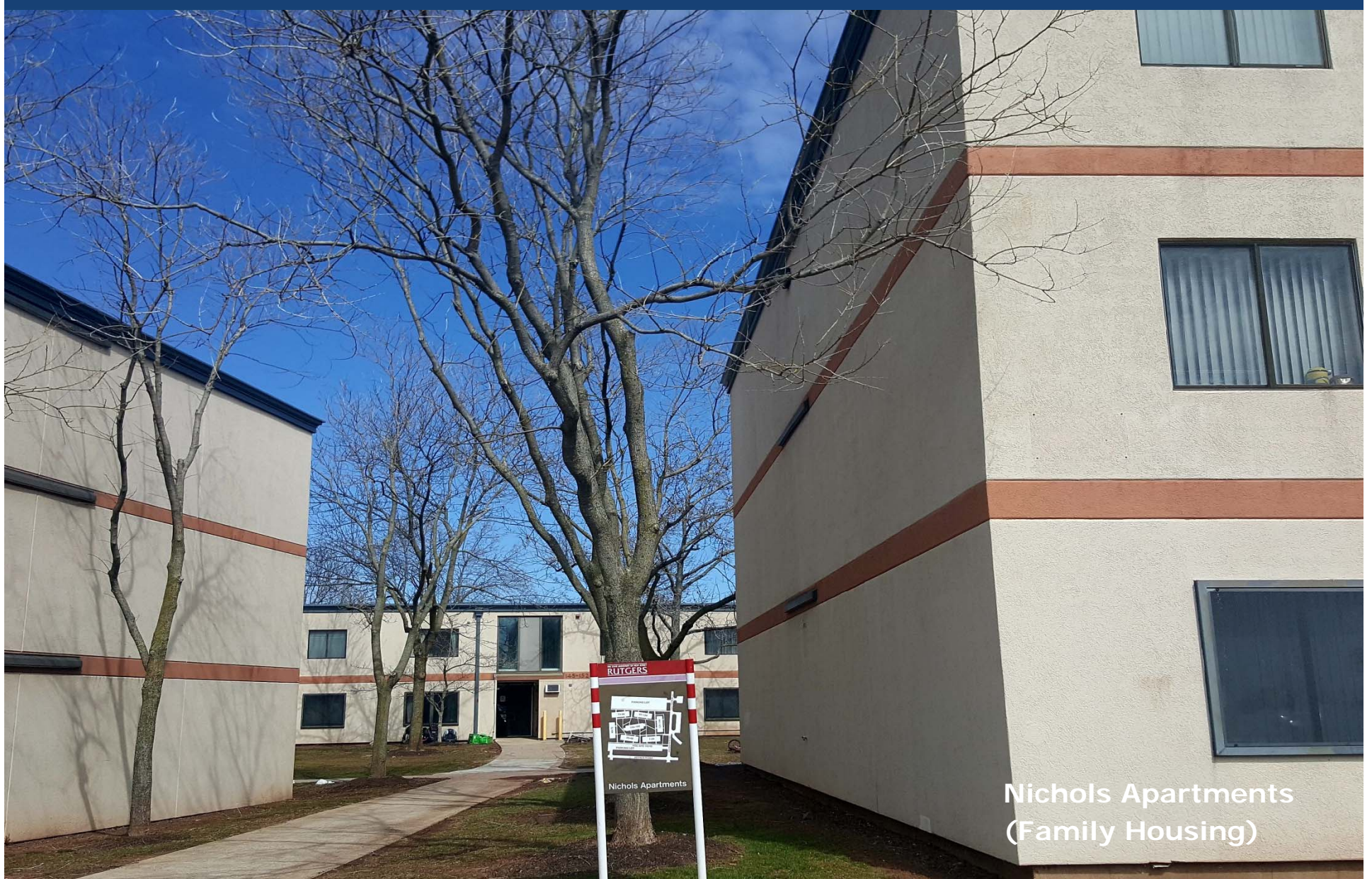
Nichols Apartments (Family Housing)