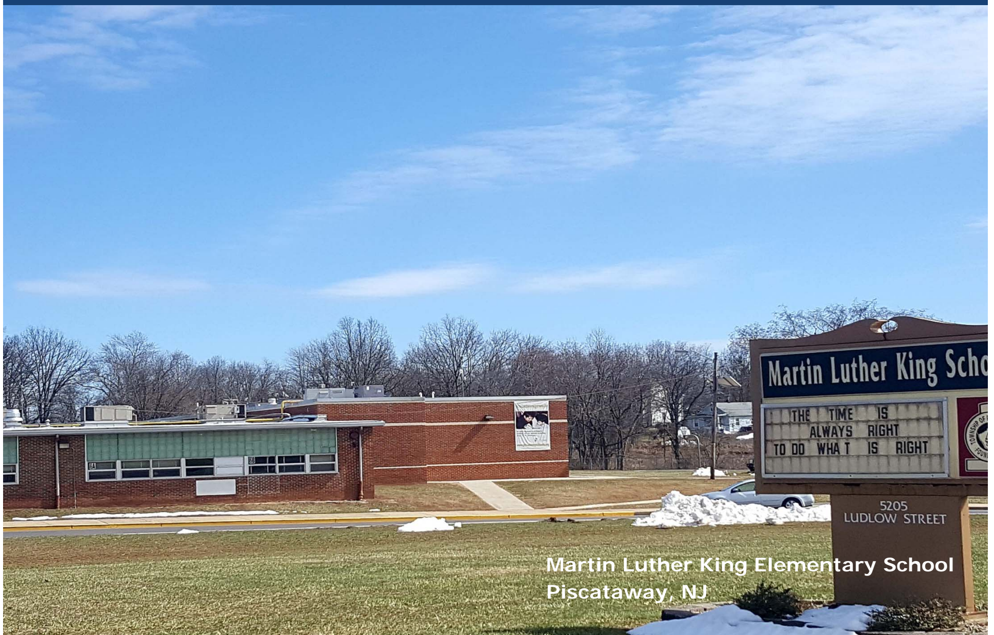
Martin Luther King Elementary School Piscataway, NJ