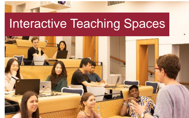
Interactive Teaching Spaces