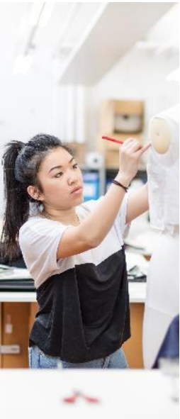
Arts, Humanities and Cultures