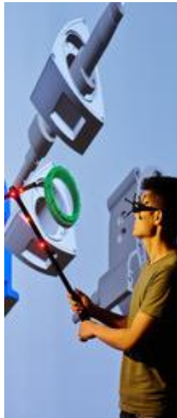
Engineering and Physical Sciences