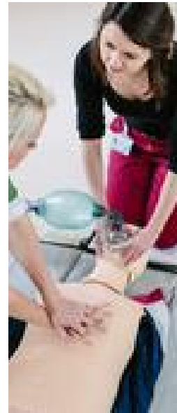
Medicine and Health