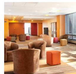
Flats at 374

83 furnished 2-bedroom apartments, many with patios or balconies, housing close to 200 students.