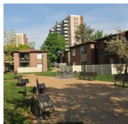
Grand Forest Apartments

Two apartment complexes on the east side of campus. There are over 260 apartments available to upperclassmen students.