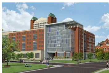
Coming Soon- Grand Hall (Fall 2017)

First- and second-year students, Spring Hall features single and double suite-style rooms with a total of 450 beds