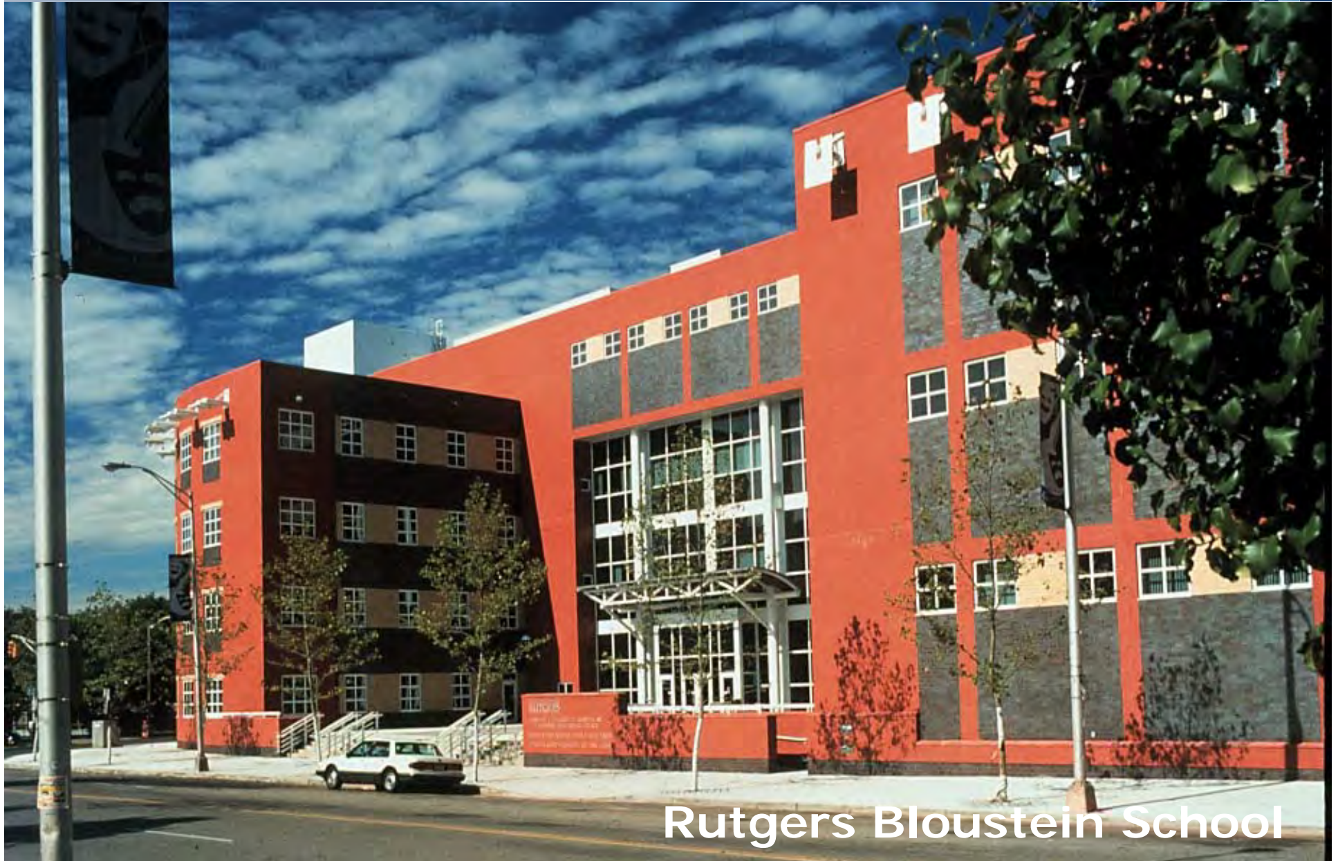
Rutgers Bloustein School