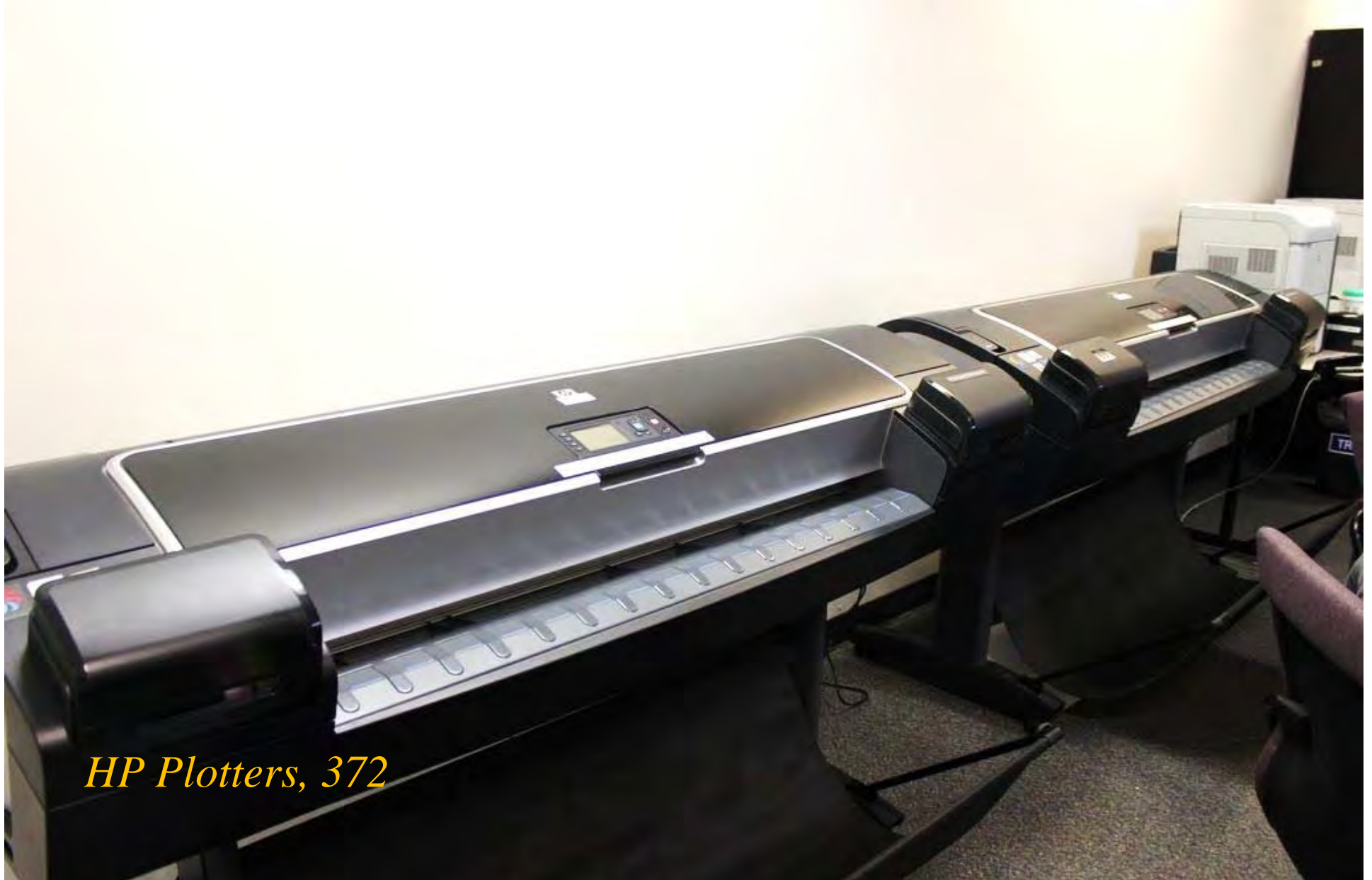
HP Plotters, 372