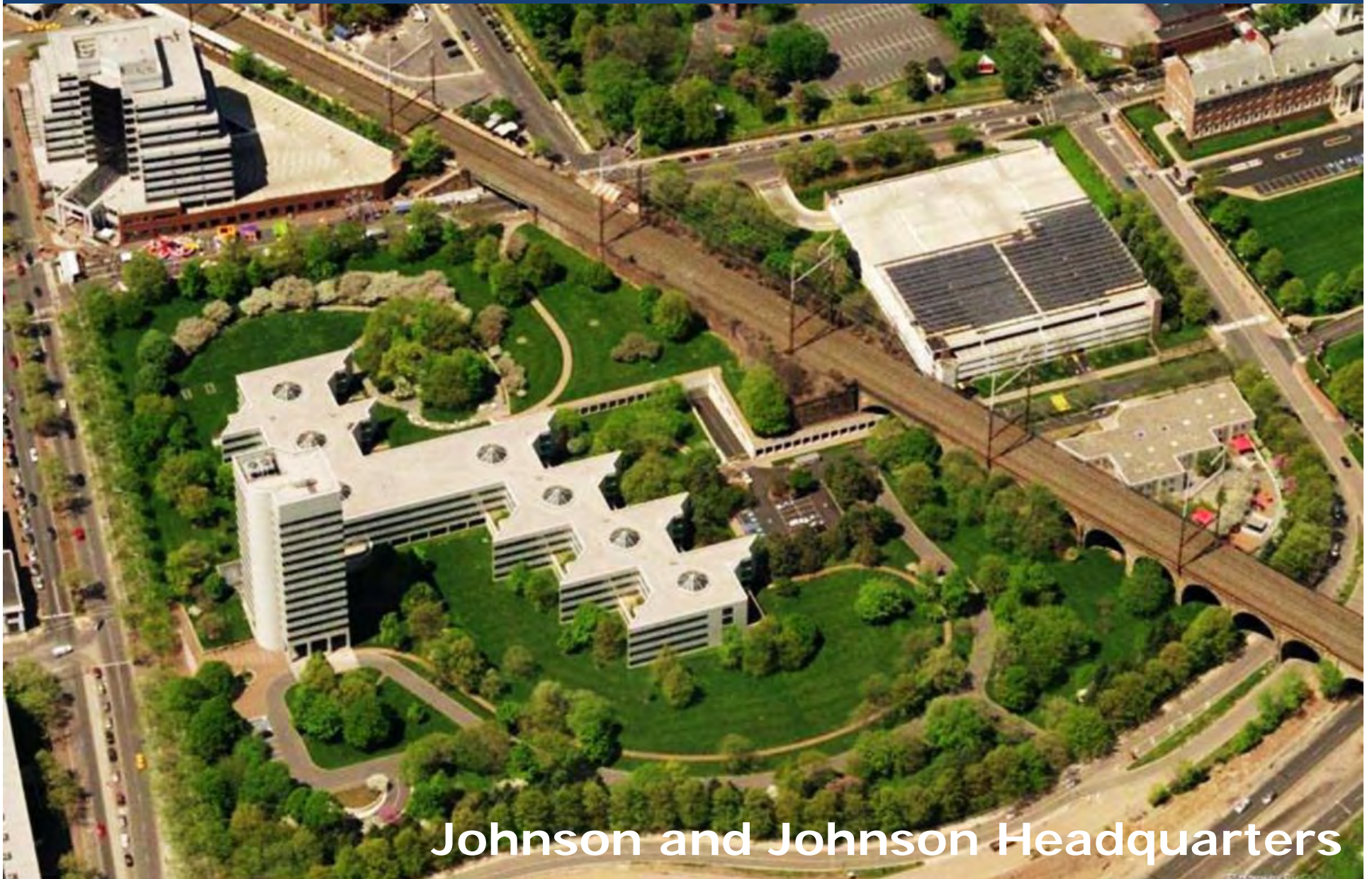
Johnson and Johnson Headquarters