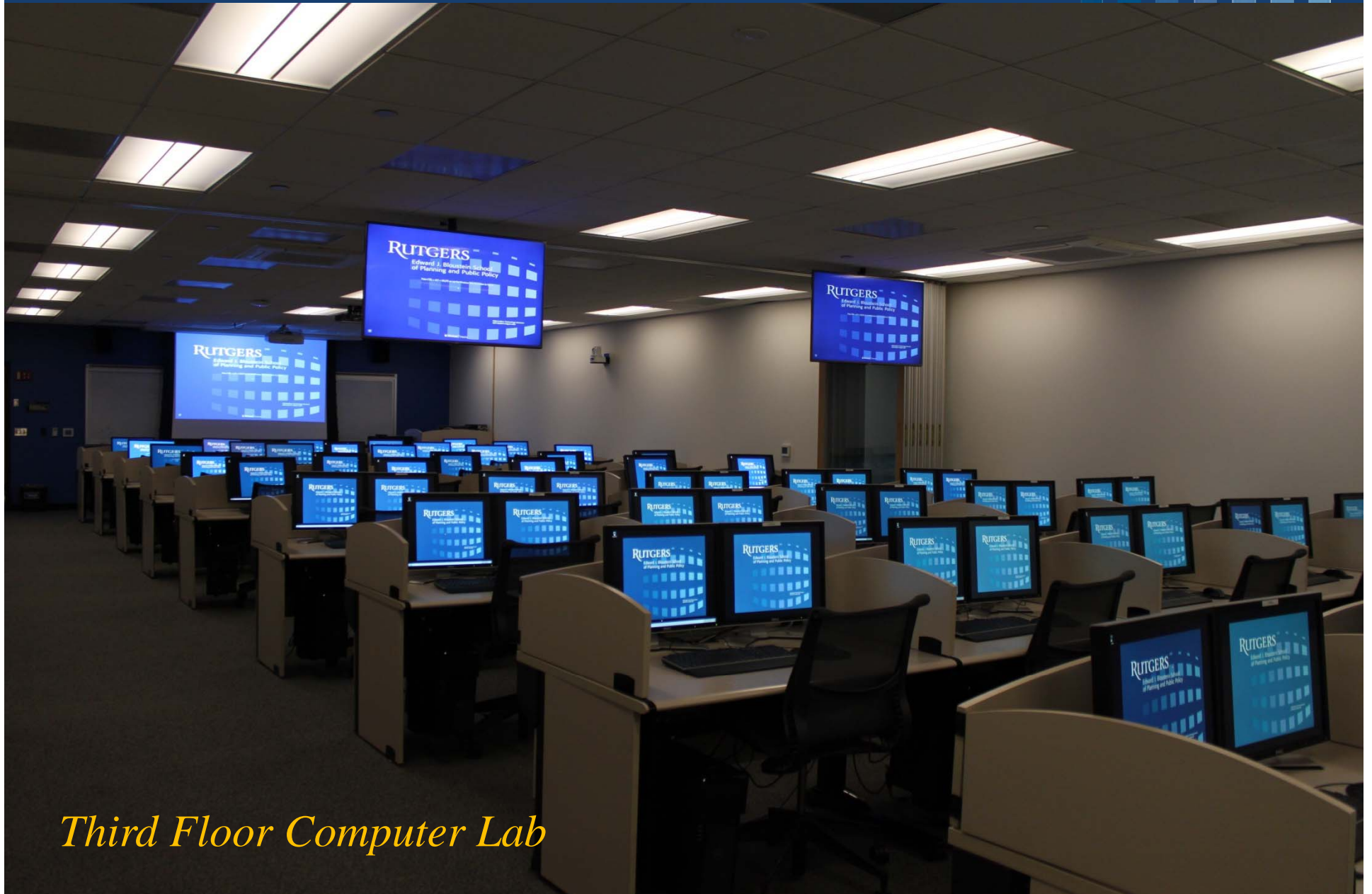
Third Floor Computer Lab