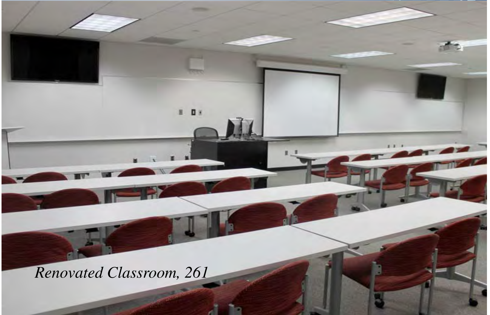
Renovated Classroom, 261