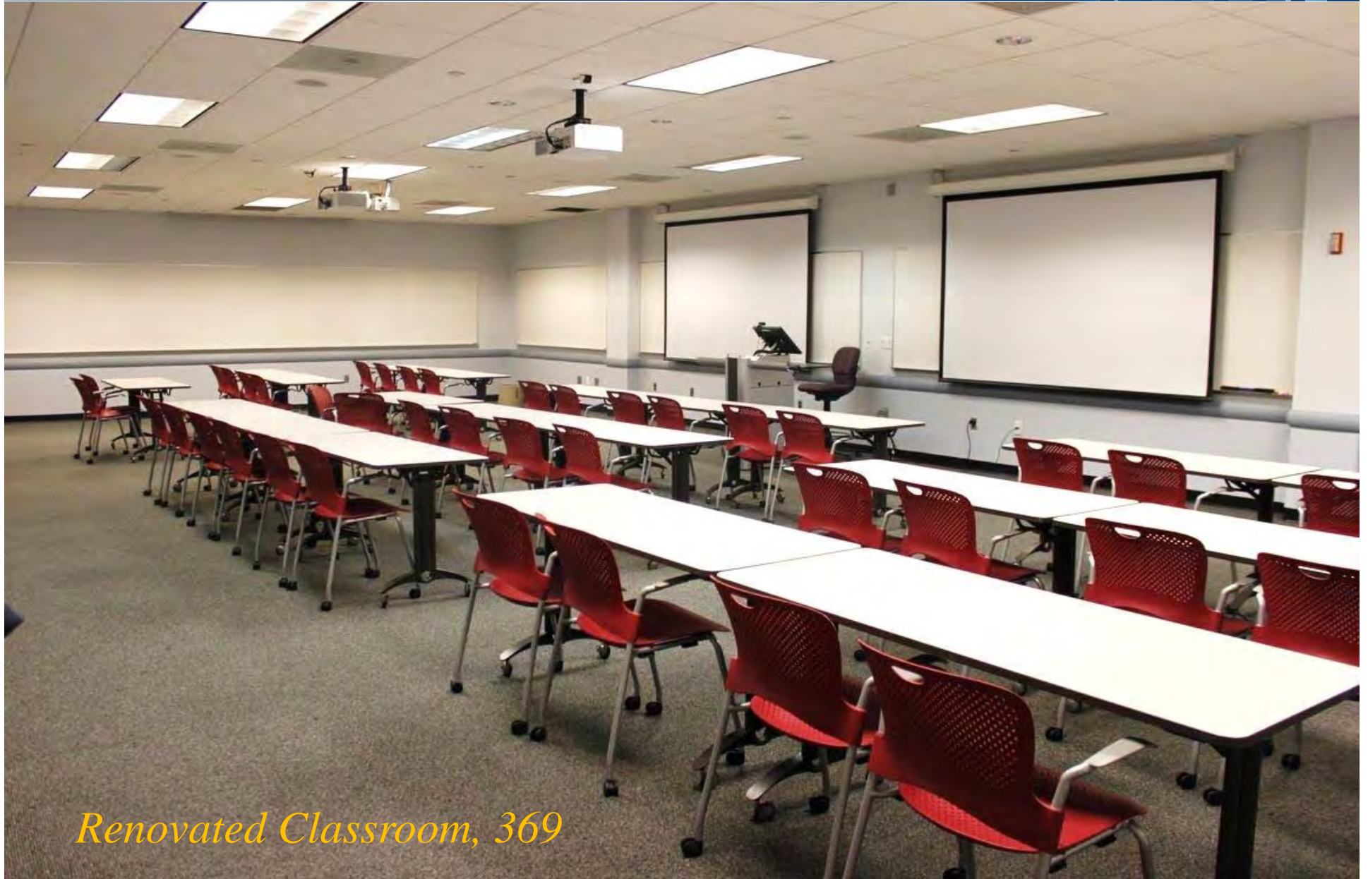
Renovated Classroom, 369